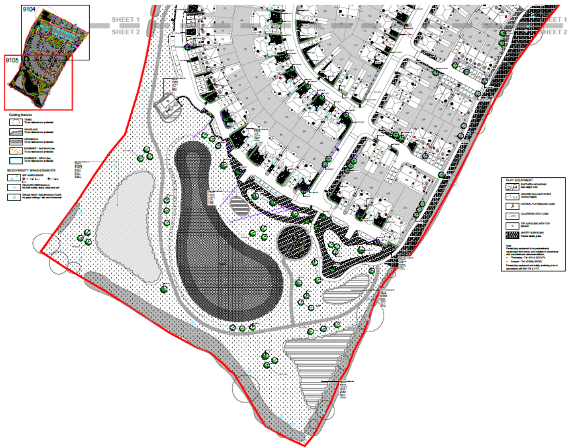
Figure 9 Proposed Landscape Masterplan Part 2

6.8.7. The proposal is a well-considered scheme in landscape terms which complies with relevant local and national policy.