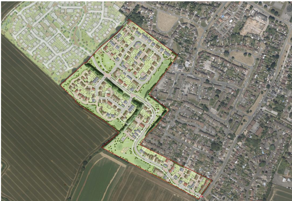
Figure 4 - Land at Bilsham Road Yapton Layout