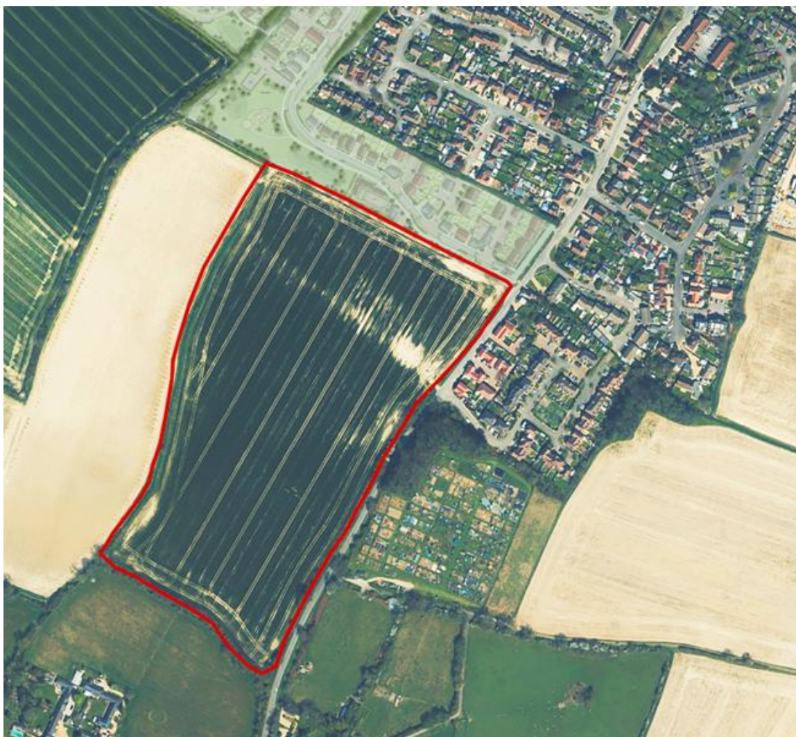
Figure 1 – Aerial Image with Site outlined in Red