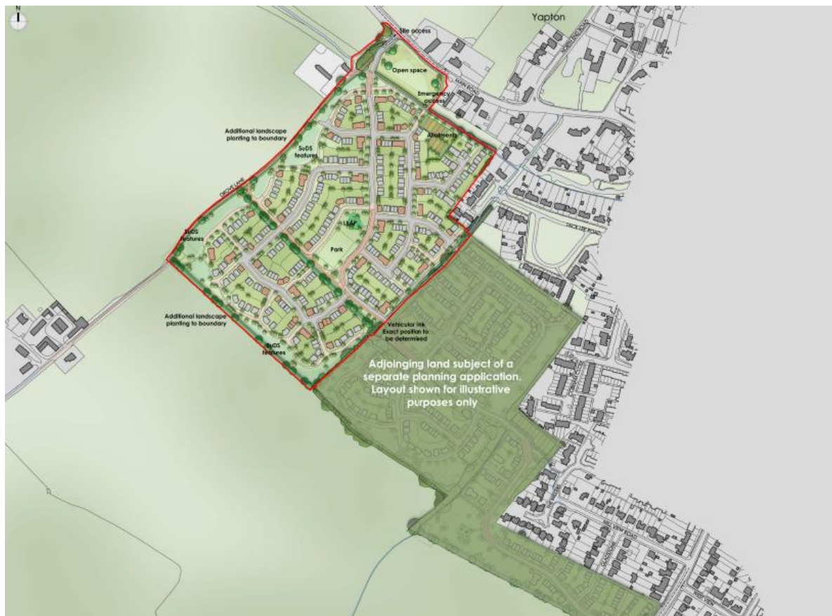
Figure 5 - Land at Drove Lane Yapton Layout