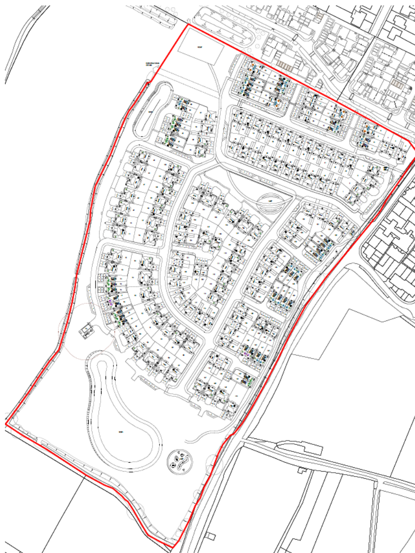
Figure 6 - Proposed Site Plan