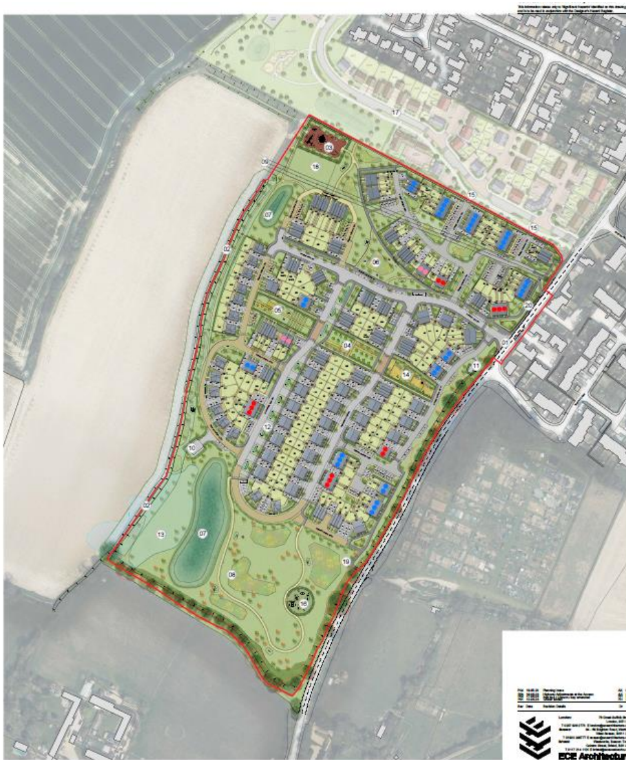
Figure 3 - Proposed layout for 170-unit scheme