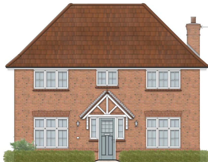
Front Elevation - Plot 132