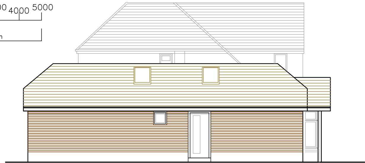
PROPOSED EAST ELEVATION 1:100