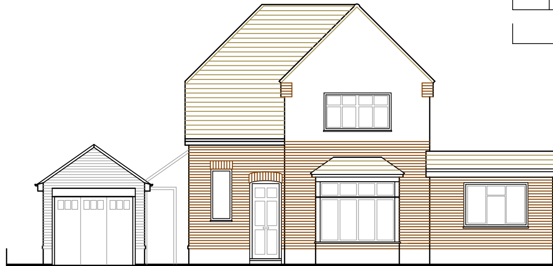
EXISTING NORTH ELEVATION 1:100