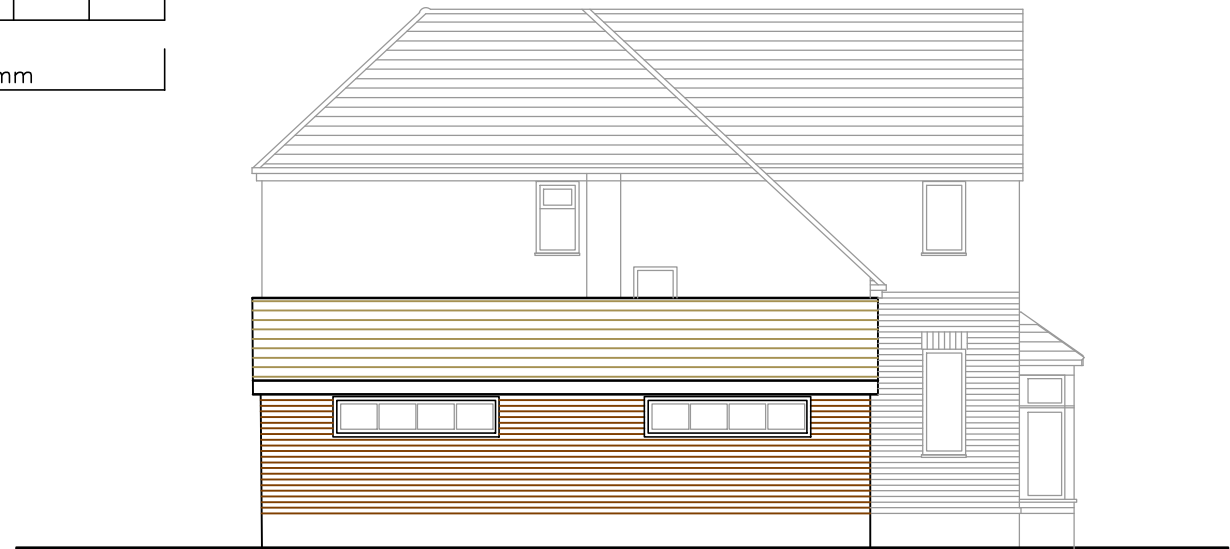
EXISTING EAST ELEVATION 1:100