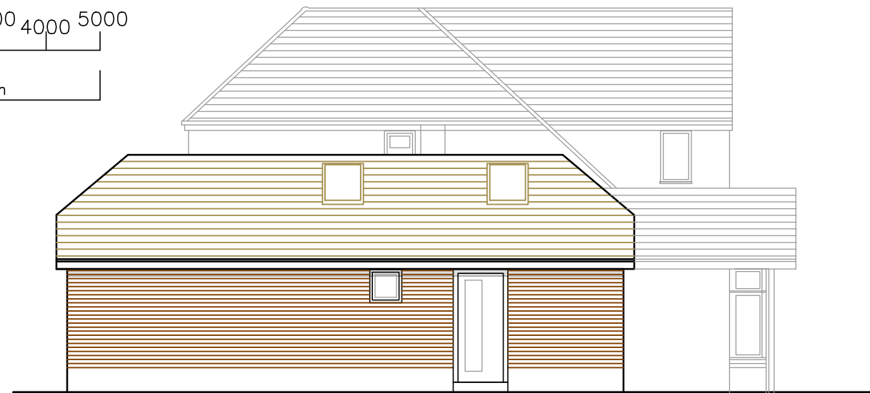
PROPOSED EAST ELEVATION 1:100