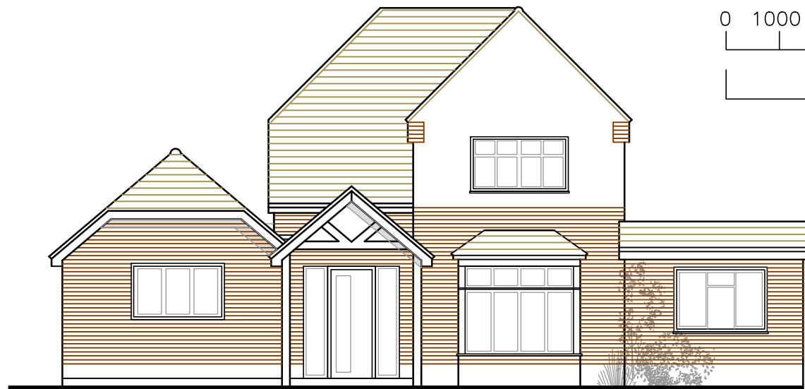
PROPOSED NORTH ELEVATION 1:100