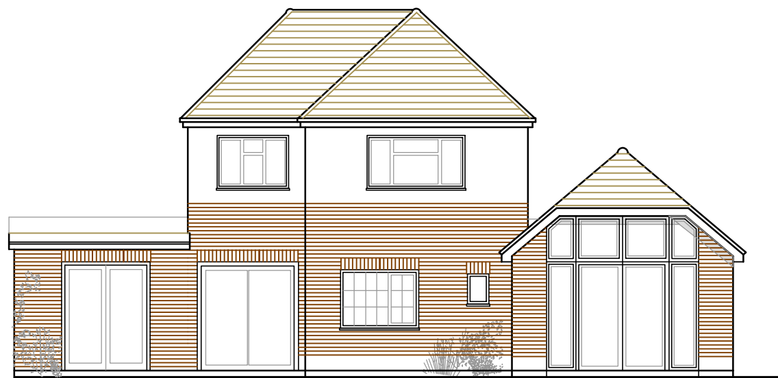
PROPOSED SOUTH ELEVATION 1:100