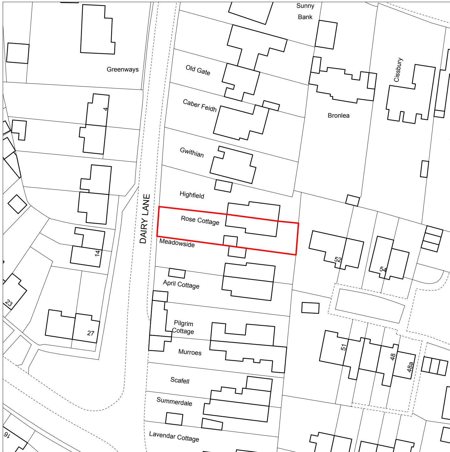
① SITE LOCATION PLAN - AS EXISTING Scale: 1:1250