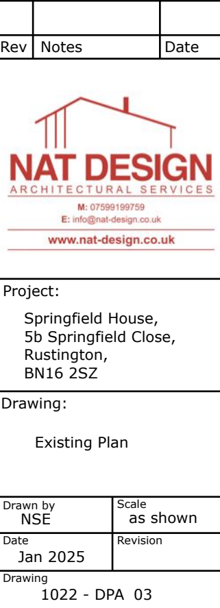
GF Plan Scale 1:50 @ A3

© nat-design, all rights reserved. Use figured dimensions only. All dimensions are to be checked on site before any work is carried out. Please contact the Architect immediately regarding any discrepancies discovered on site.