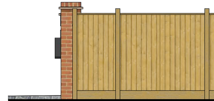
East Elev Scale 1:50 @ A3