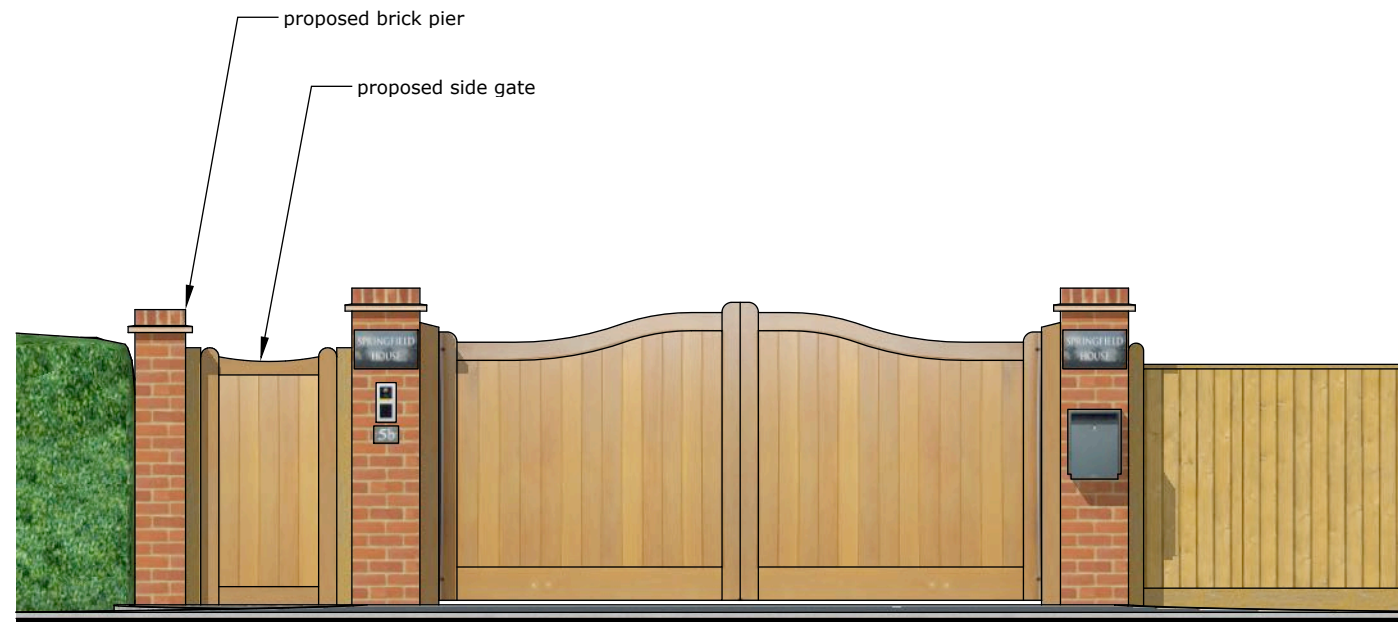
South Elev Scale 1:50 @ A3