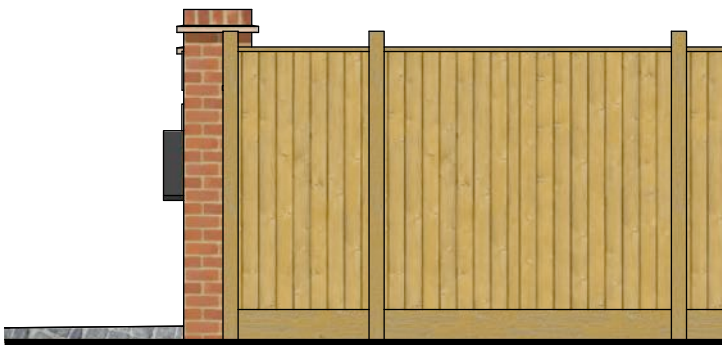
East Elev Scale 1:50 @ A3