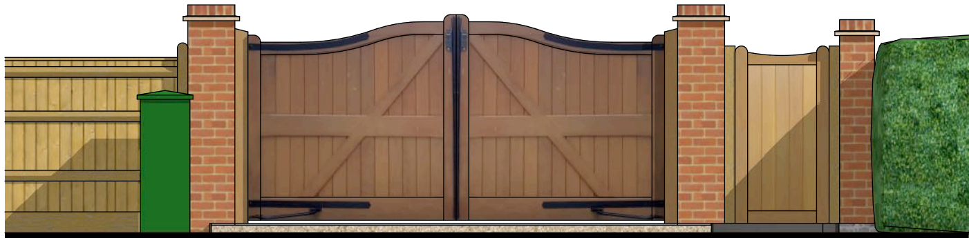
North Elev Scale 1:50 @ A3