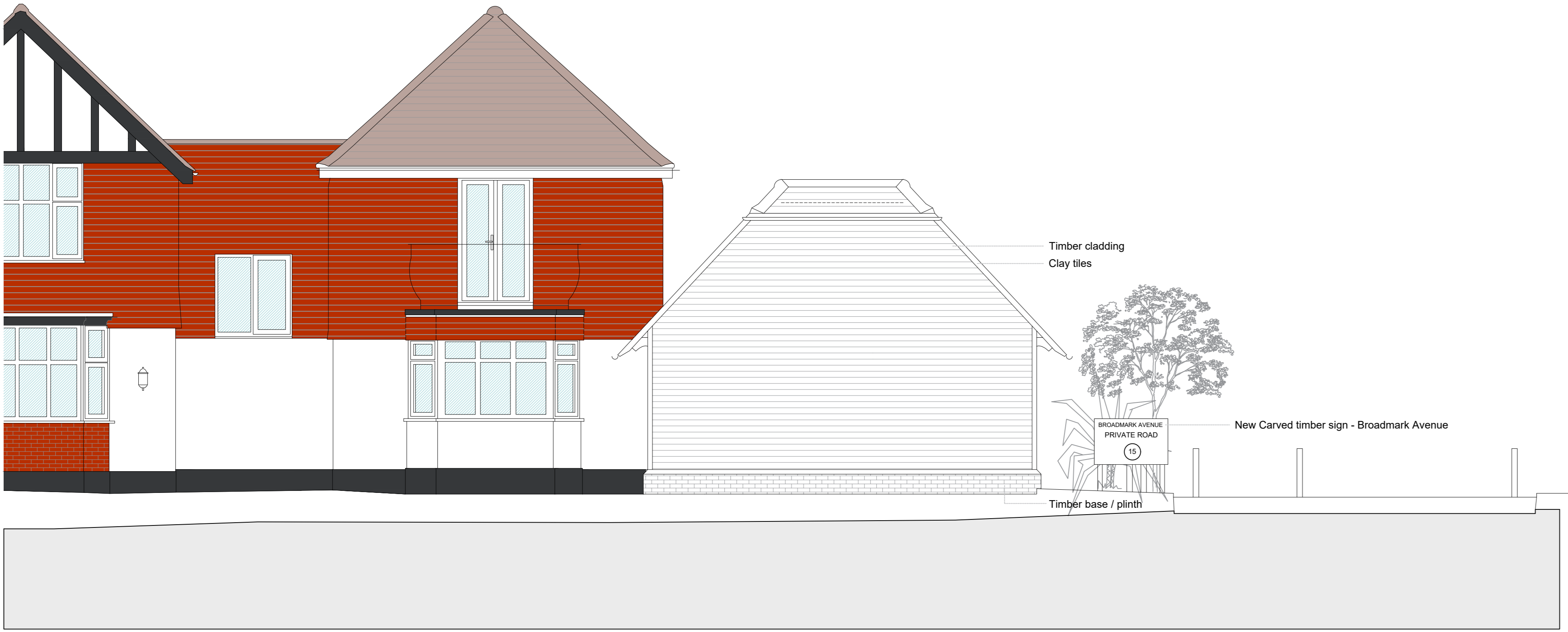
East Elevation - Proposed - 1:50@A1