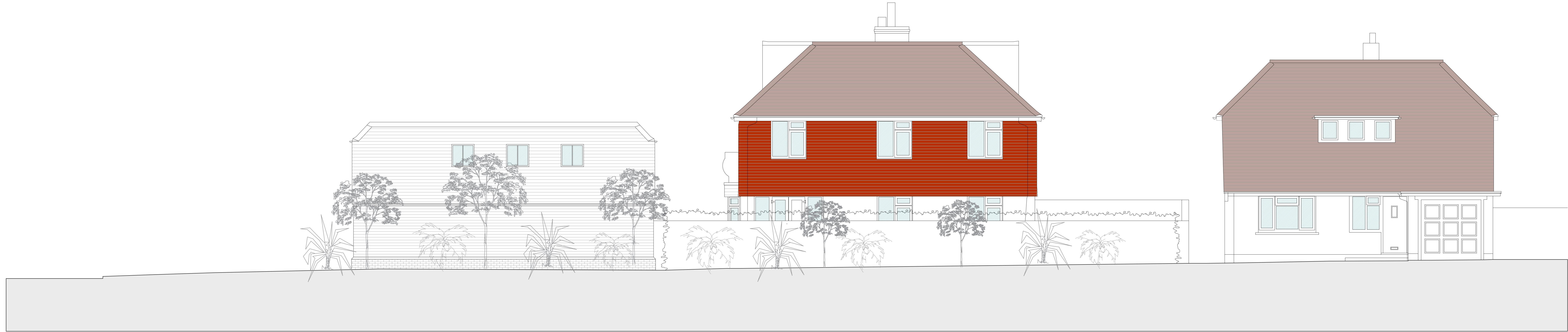
North Elevation - Proposed - 1:50@A1