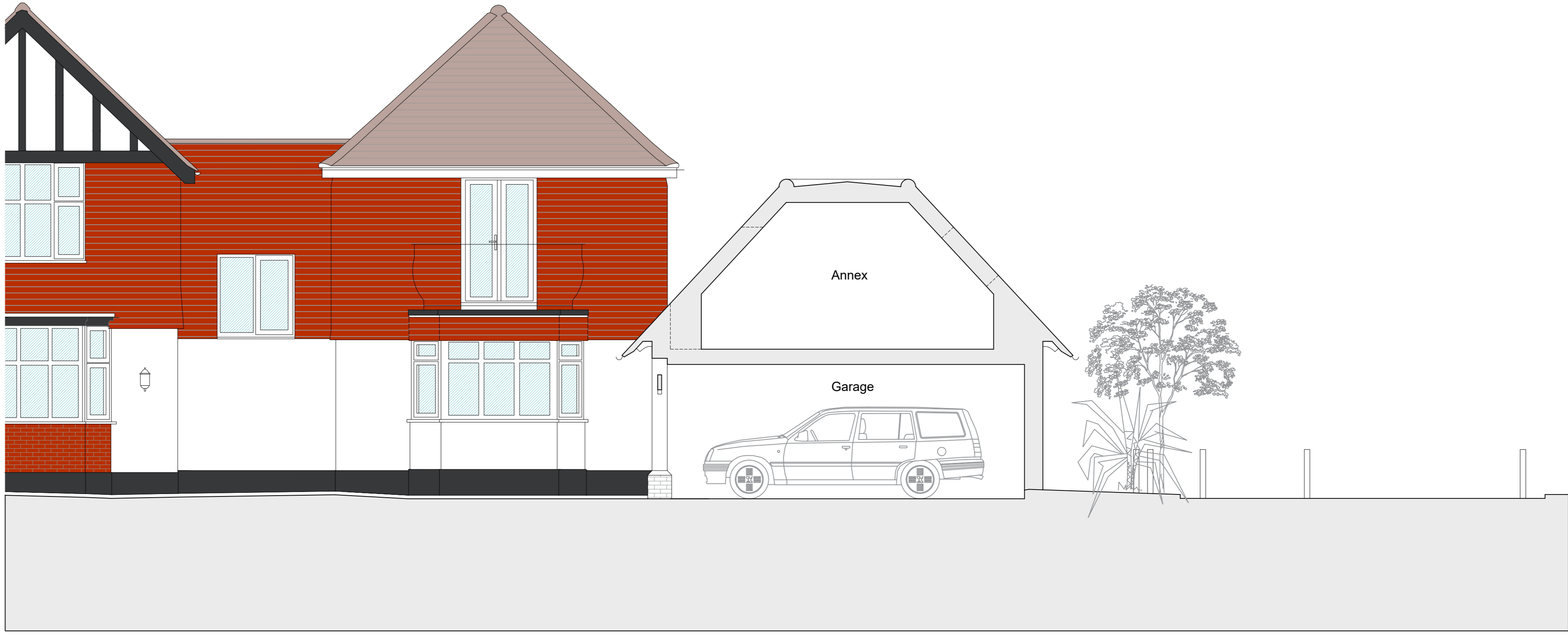
Section AA - Proposed - 1:50@A1