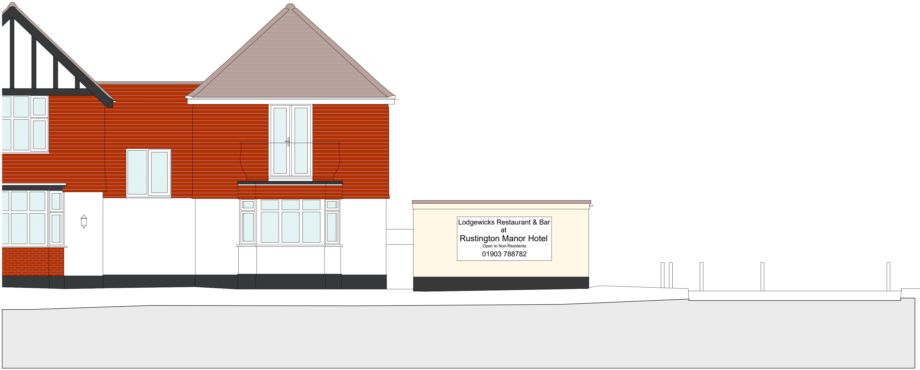
East Elevation - Existing - 1:50@A1