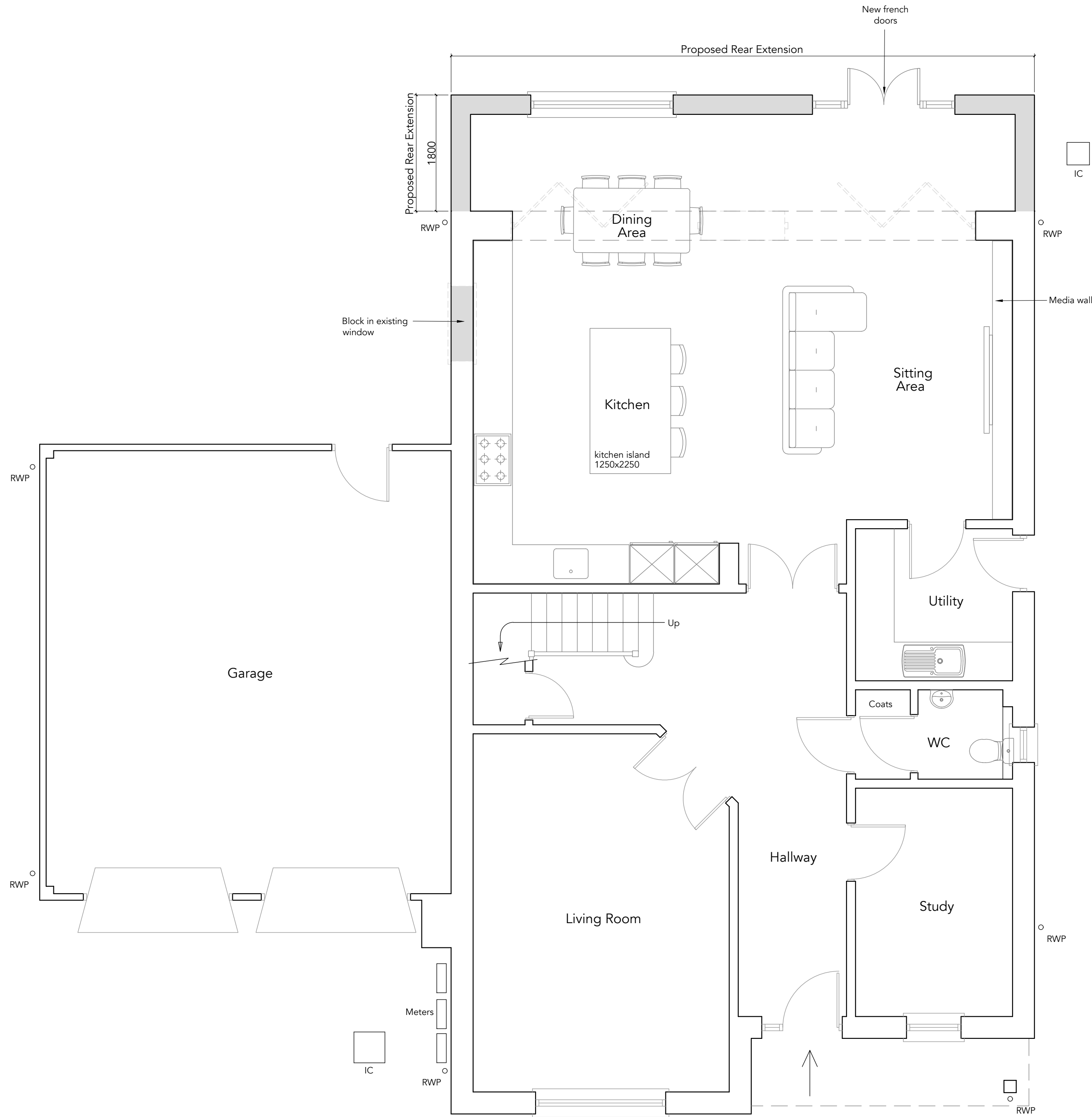
Ground Floor Plan Proposed 1:50