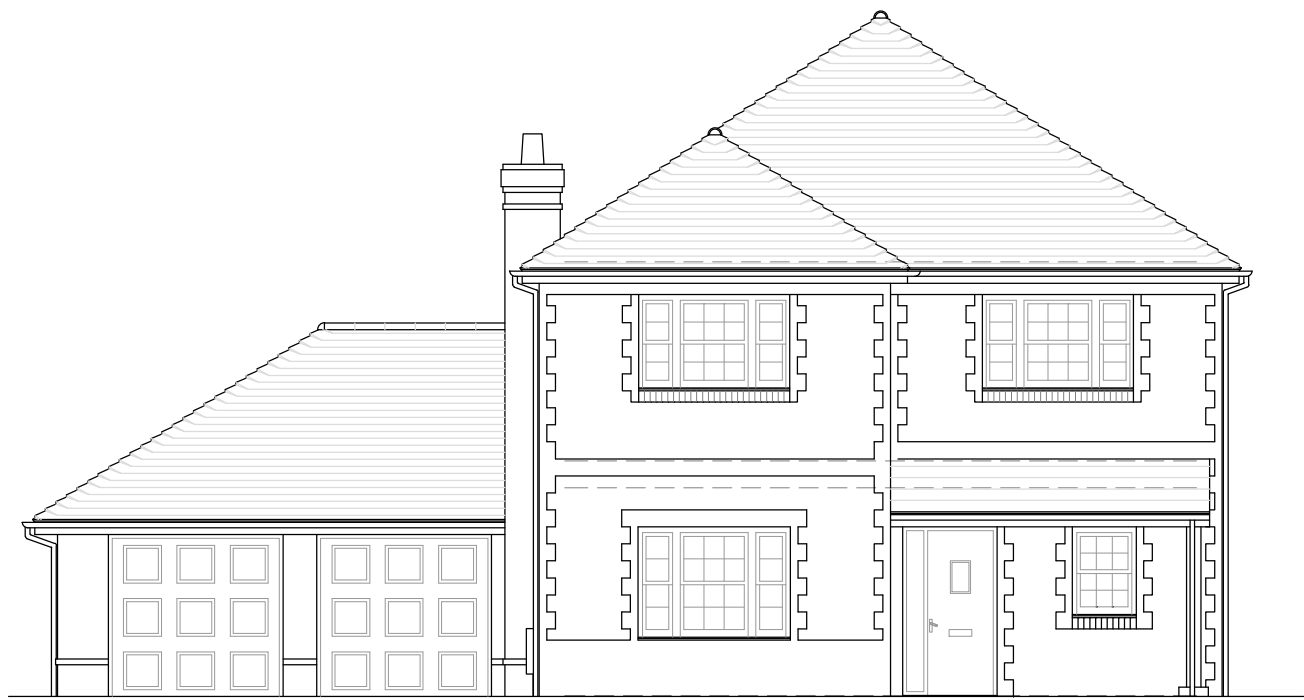
North Elevation (Front)