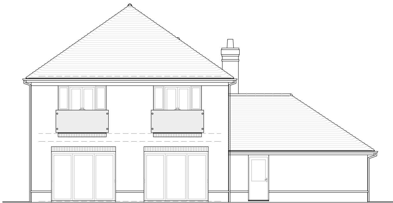
South Elevation (Rear)