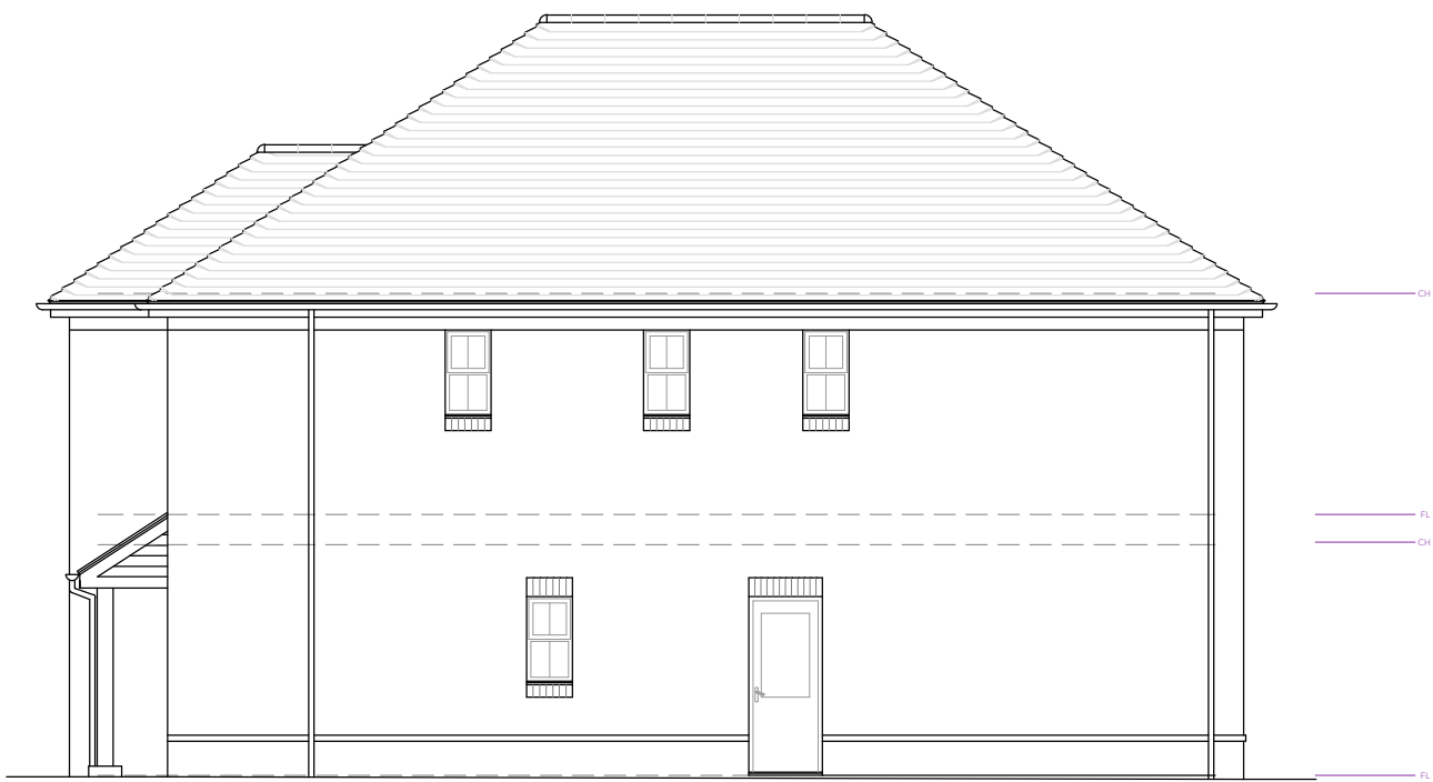
West Elevation (Side)