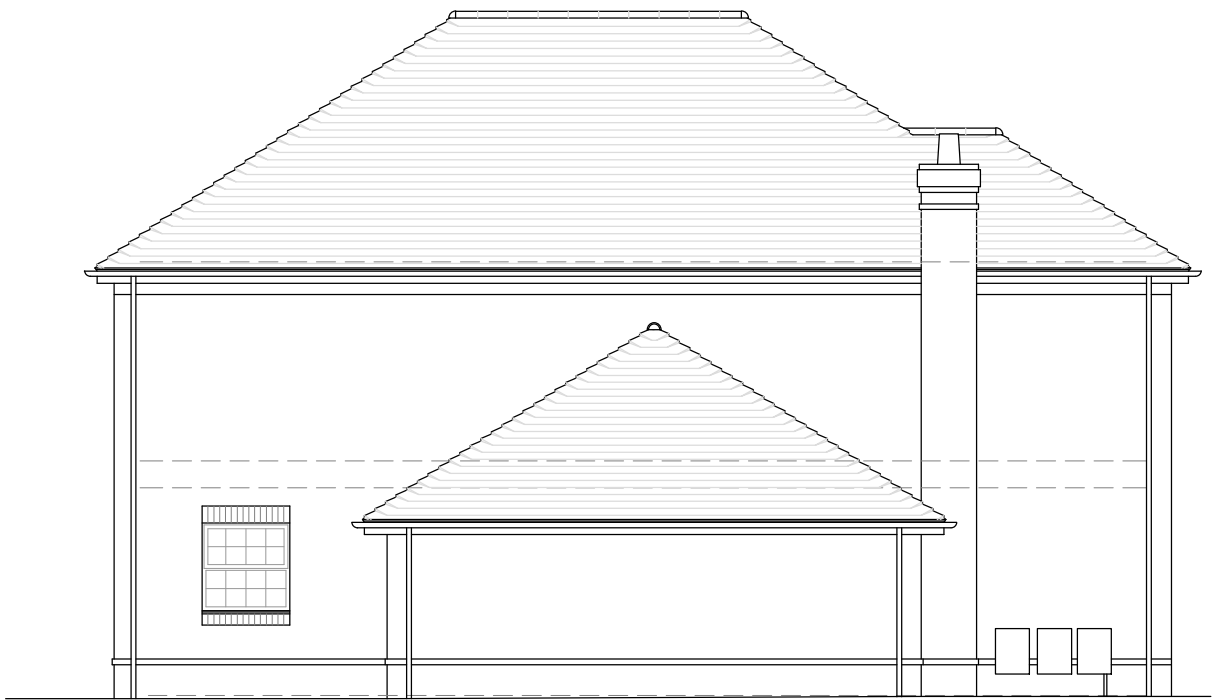
East Elevation (Side)