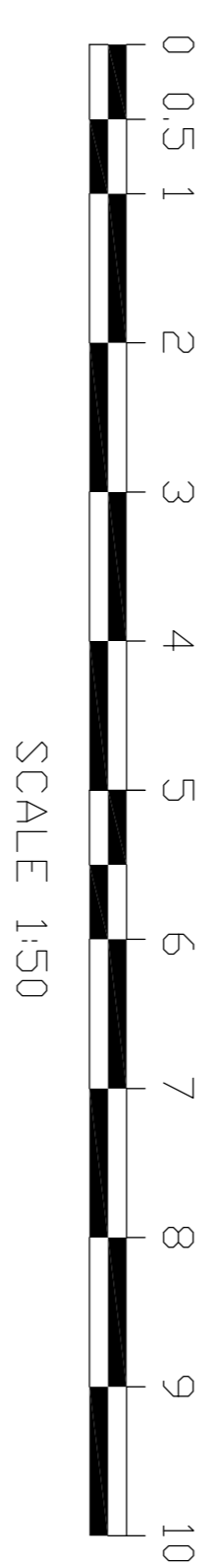
Existing Roof Plan