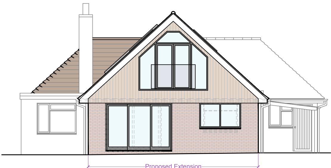
East Elevation – (Rear)