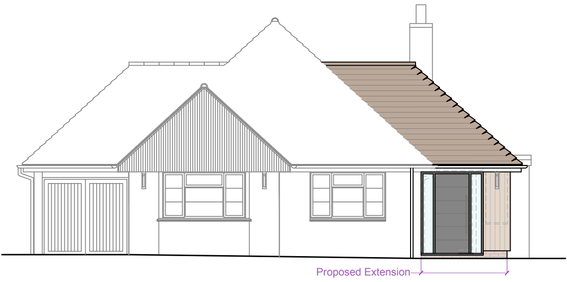
West Elevation – (Front)