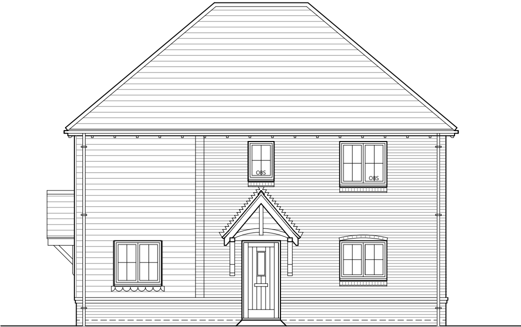
Side Entrance Elevation