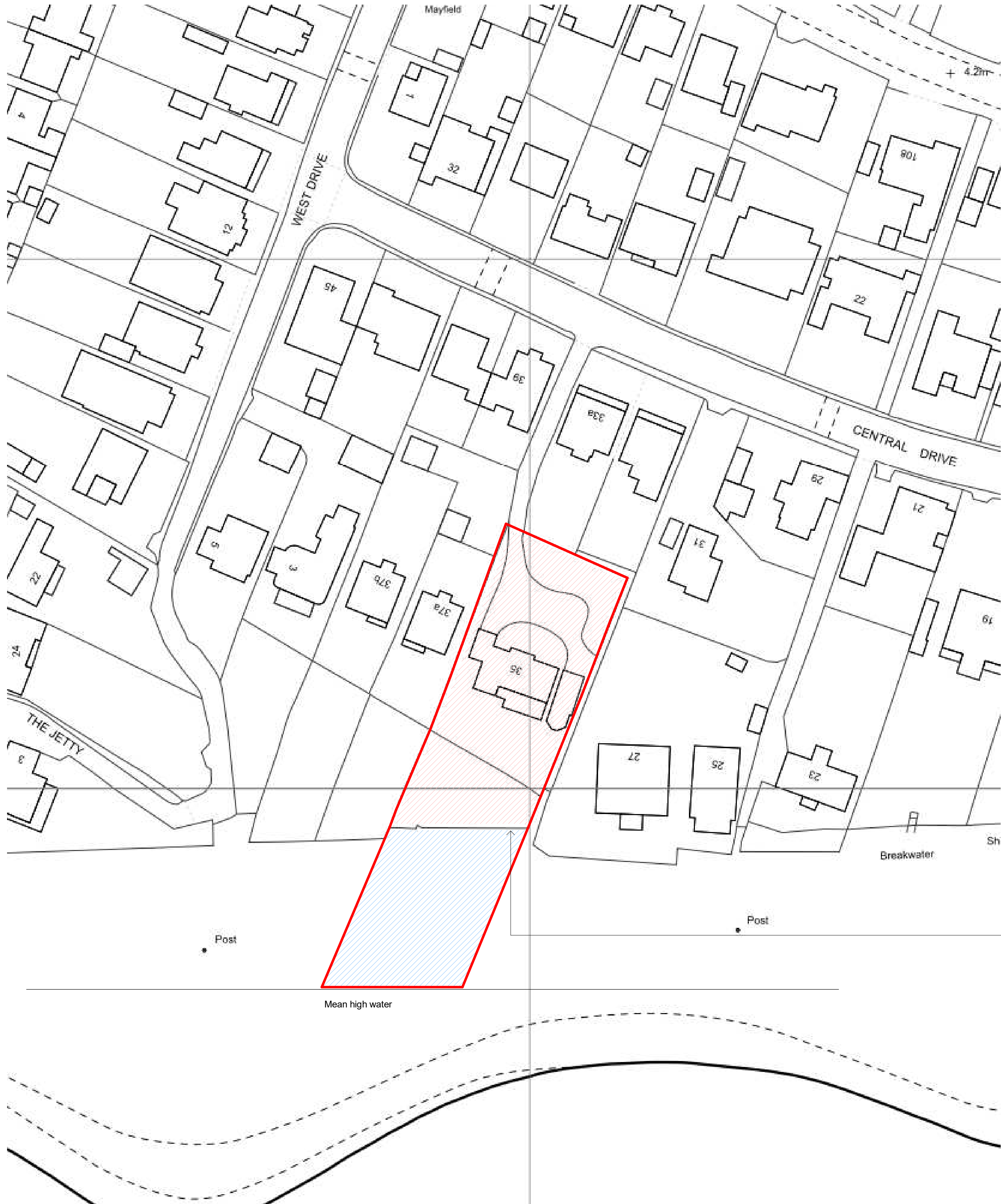
Site plan 1:500