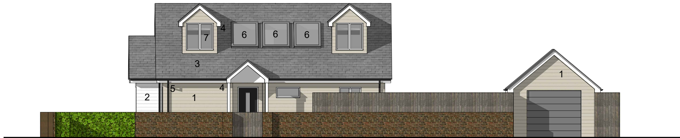
proposed street scene along North Avenue facing north

33 North Avenue, Middleton On Sea Proposed street elevations and section 1:100 at A3