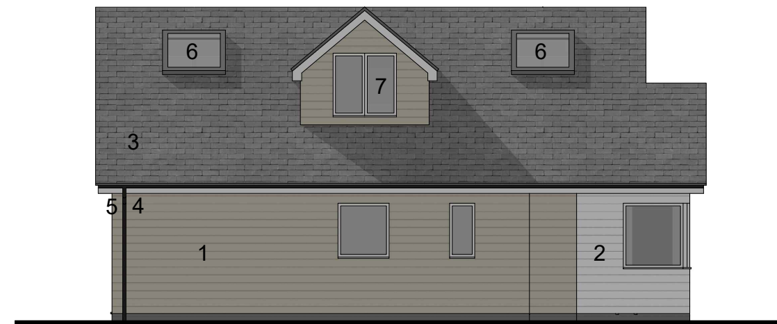
proposed rear elevation to boundary (south)