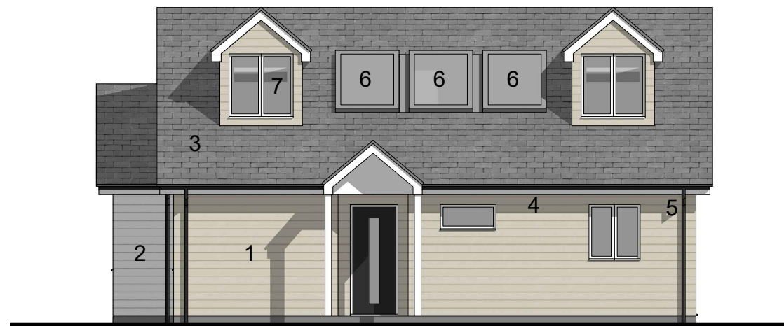
proposed front elevation to North Avenue (north)