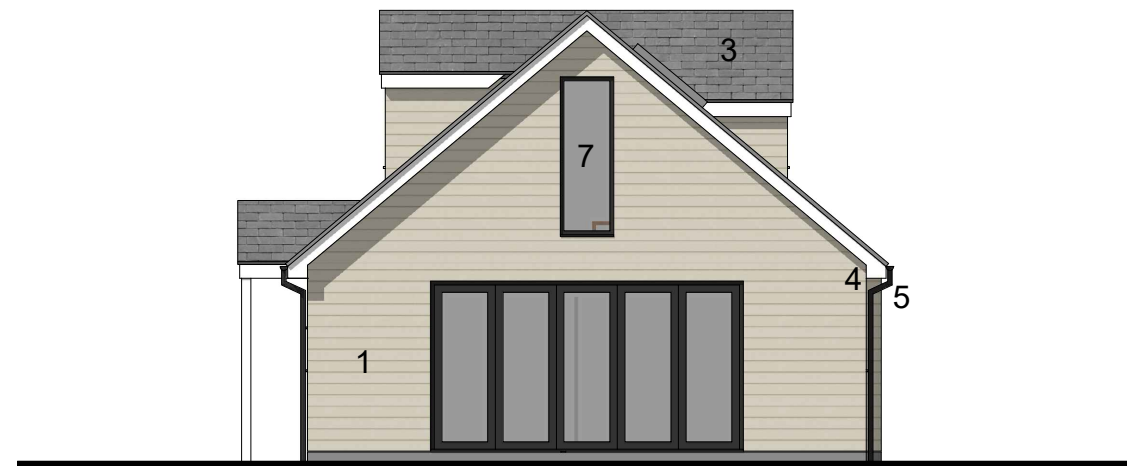
proposed garden elevation (west)