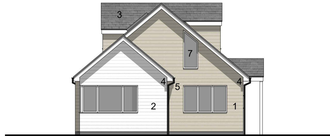
proposed front elevation to North Avenue (east)

33 North Avenue, Middleton On Sea Proposed building elevations 1:100 at A3