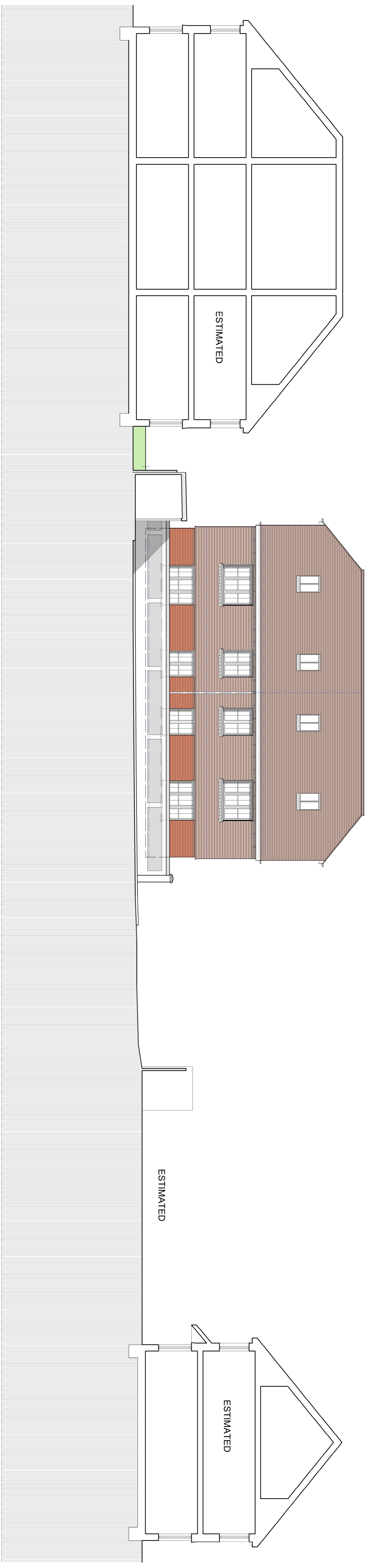
Proposed section DD Scale 1:100@A1 See drawing 10 for section reference