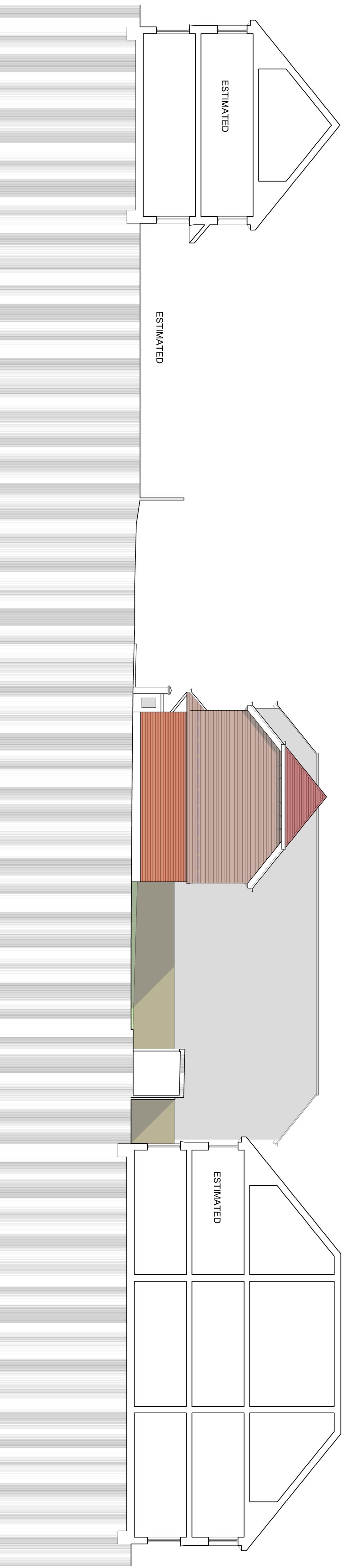
Proposed section EE Scale 1:100@A1 See drawing 10 for section reference