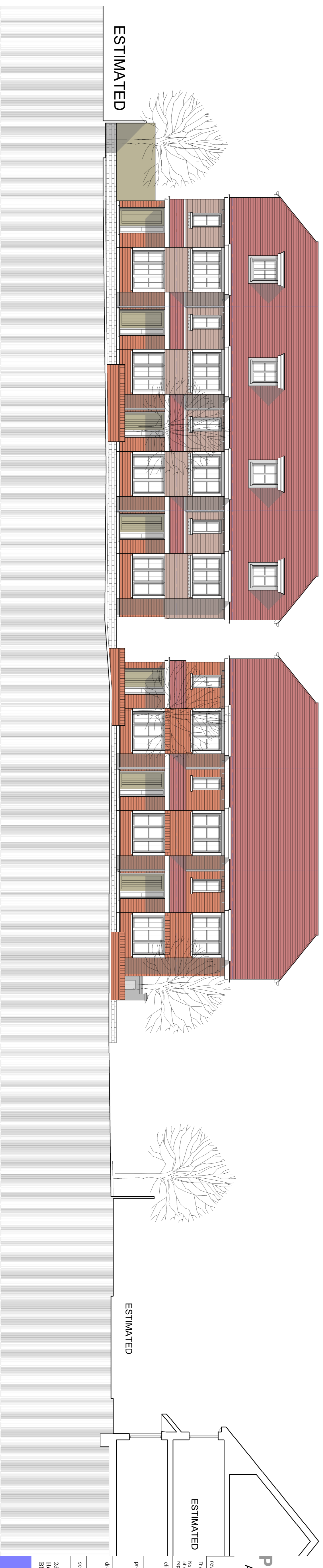
Proposed section FF Scale 1:100@A1 See drawing 10 for section reference