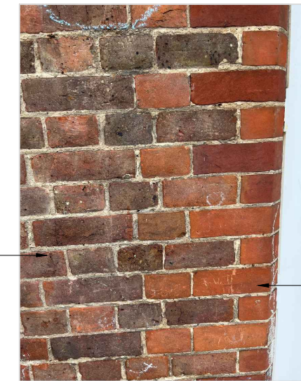
Main brickwork Red brickwork to reveals of openings