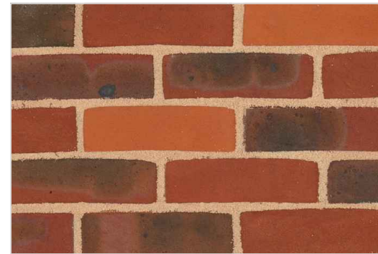
PROPOSED BRICKWORK TO REVEALS OF OPENINGS: HAMPSHIRE STOCK BUCKS MULTI