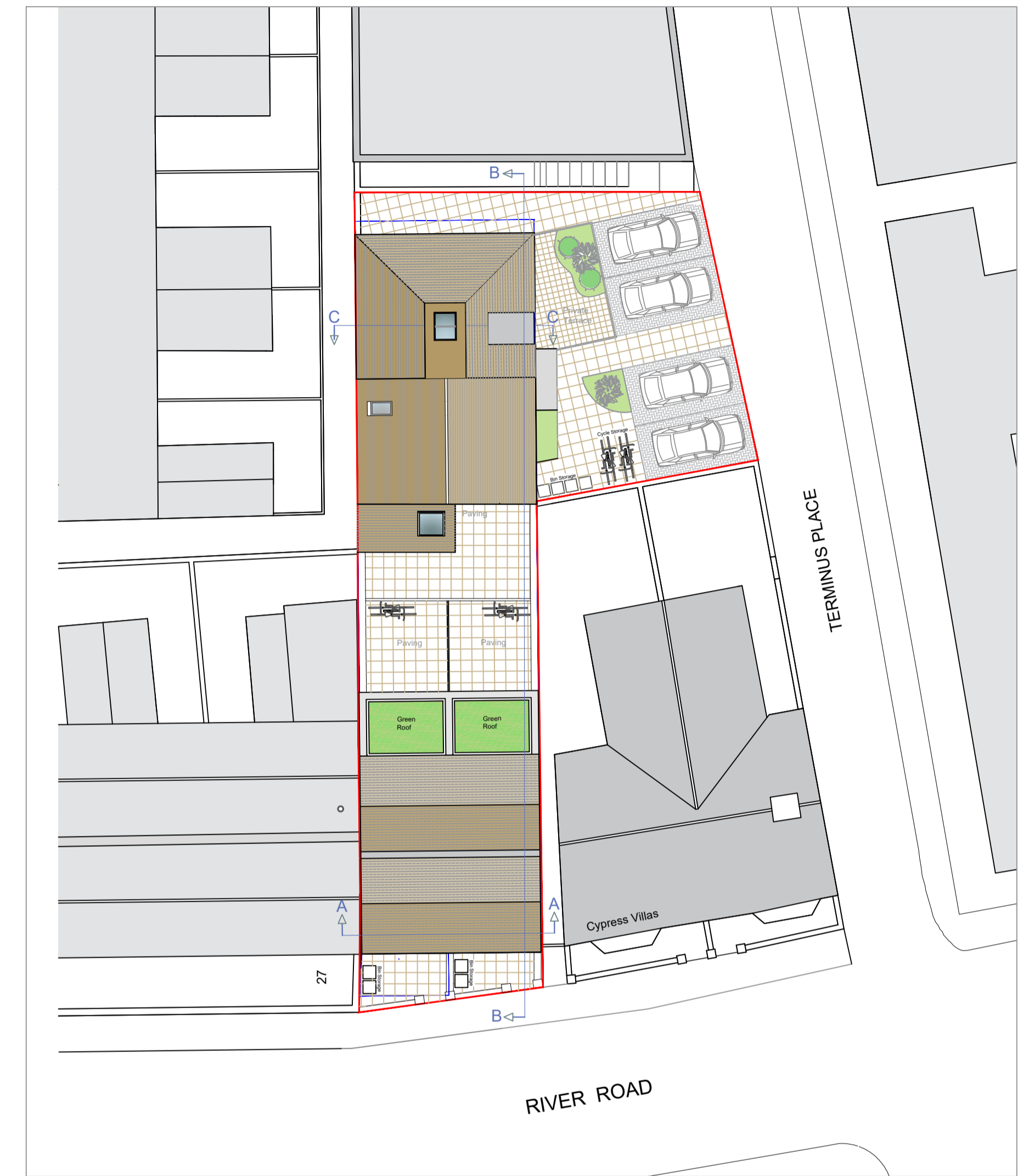
Proposed Section Lines (NTS)