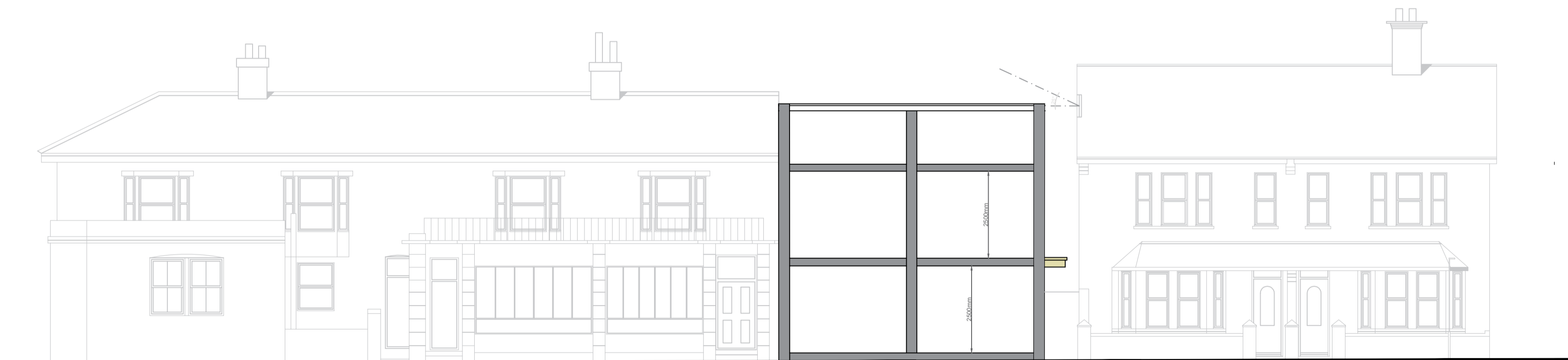
Proposed Section A - A (Scale 1:100)