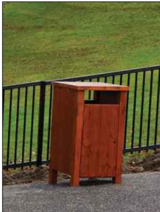
Okehampton Redwood Litter Bin from Broxap or similar and approved. Ref: BX17 4030.