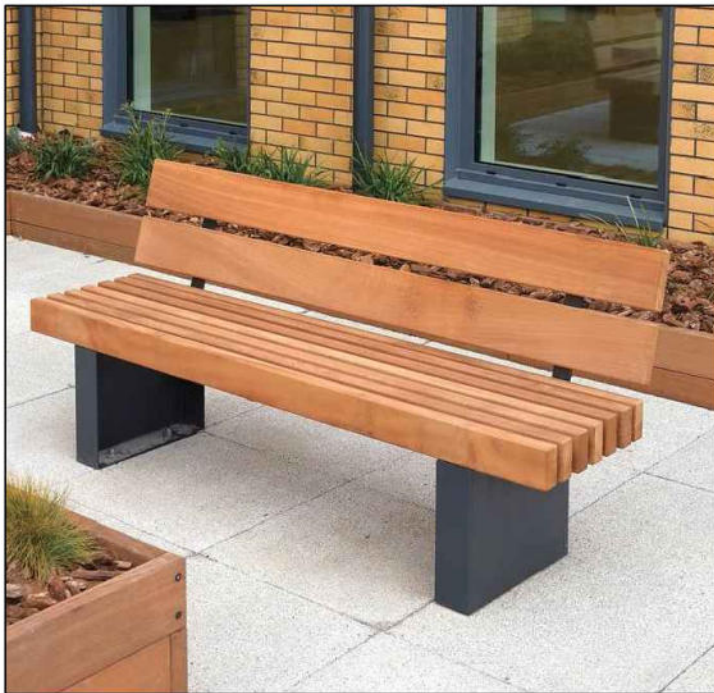
Litchard Timber Seat from Broxap or similar and approved. Ref: BX17 4071/S.