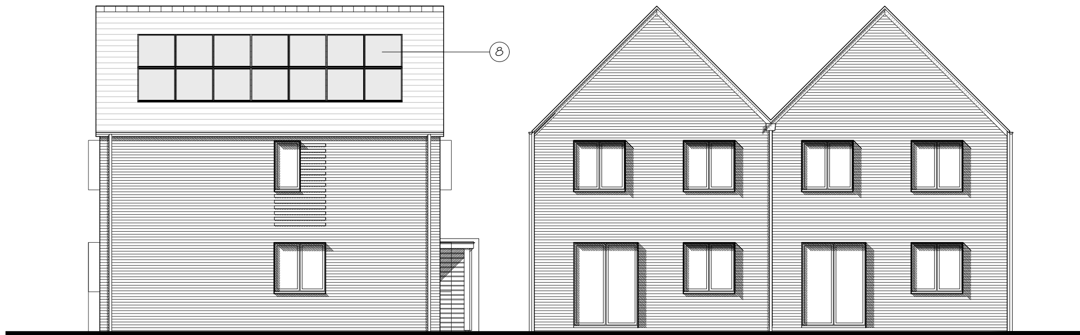
Side elevation - plots 1 and 2