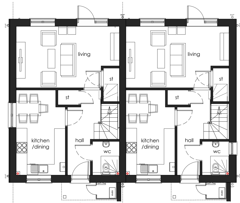
Ground floor - plots 1 and 2