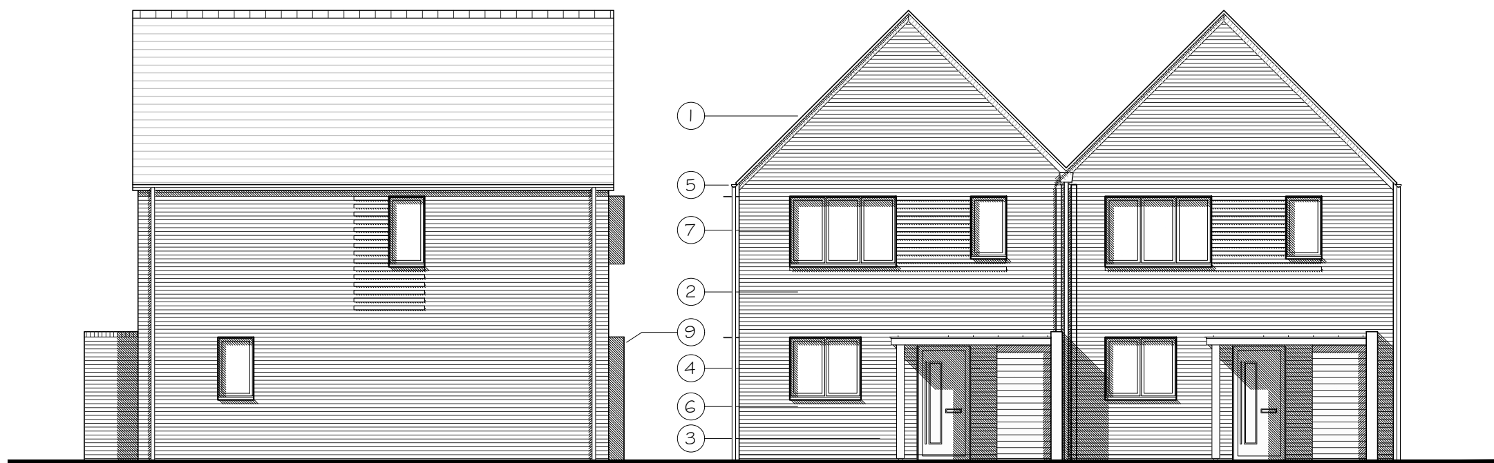
Side elevation - plots 1 and 2