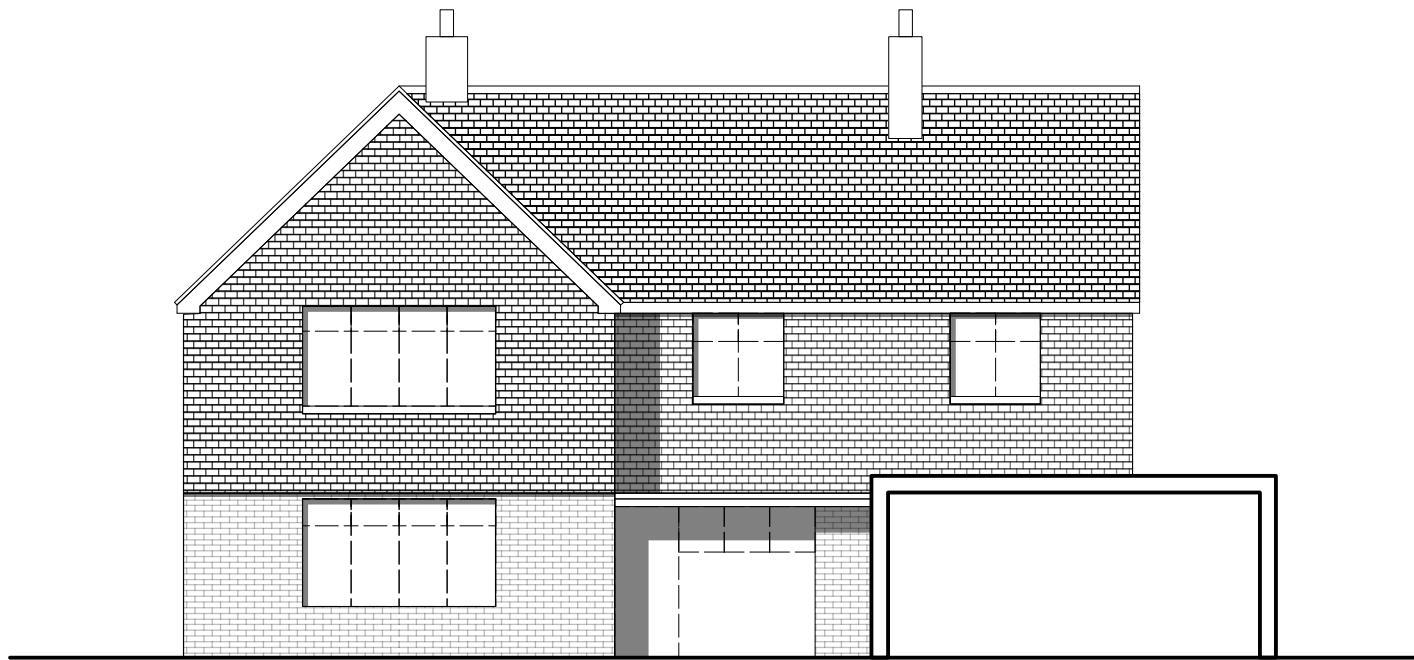
3 Existing Section (Garage) Scale: 1:100