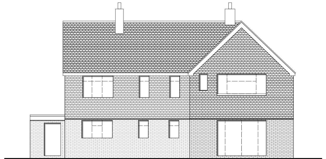
2 Existing North Elevation Scale: 1:100