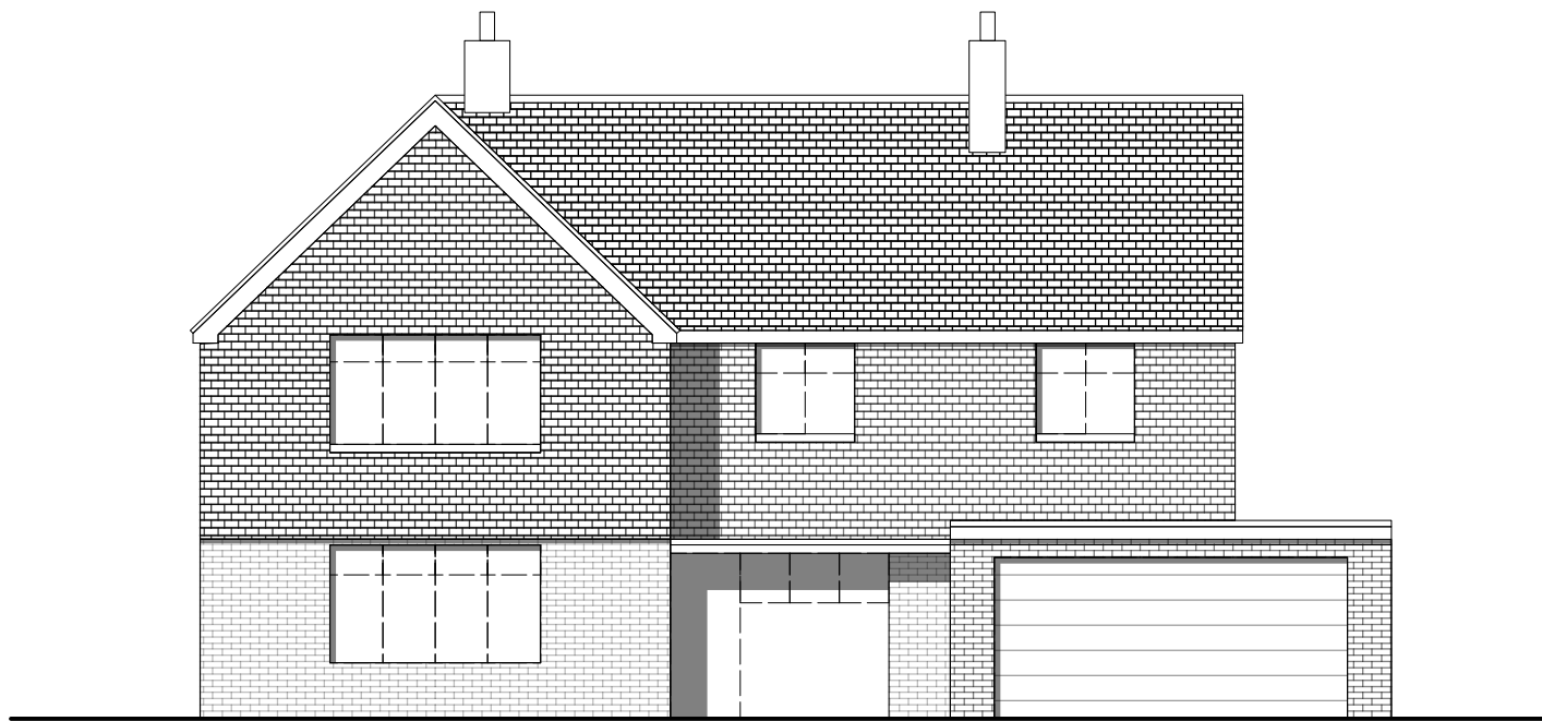
1 Existing South Elevation Scale: 1:100