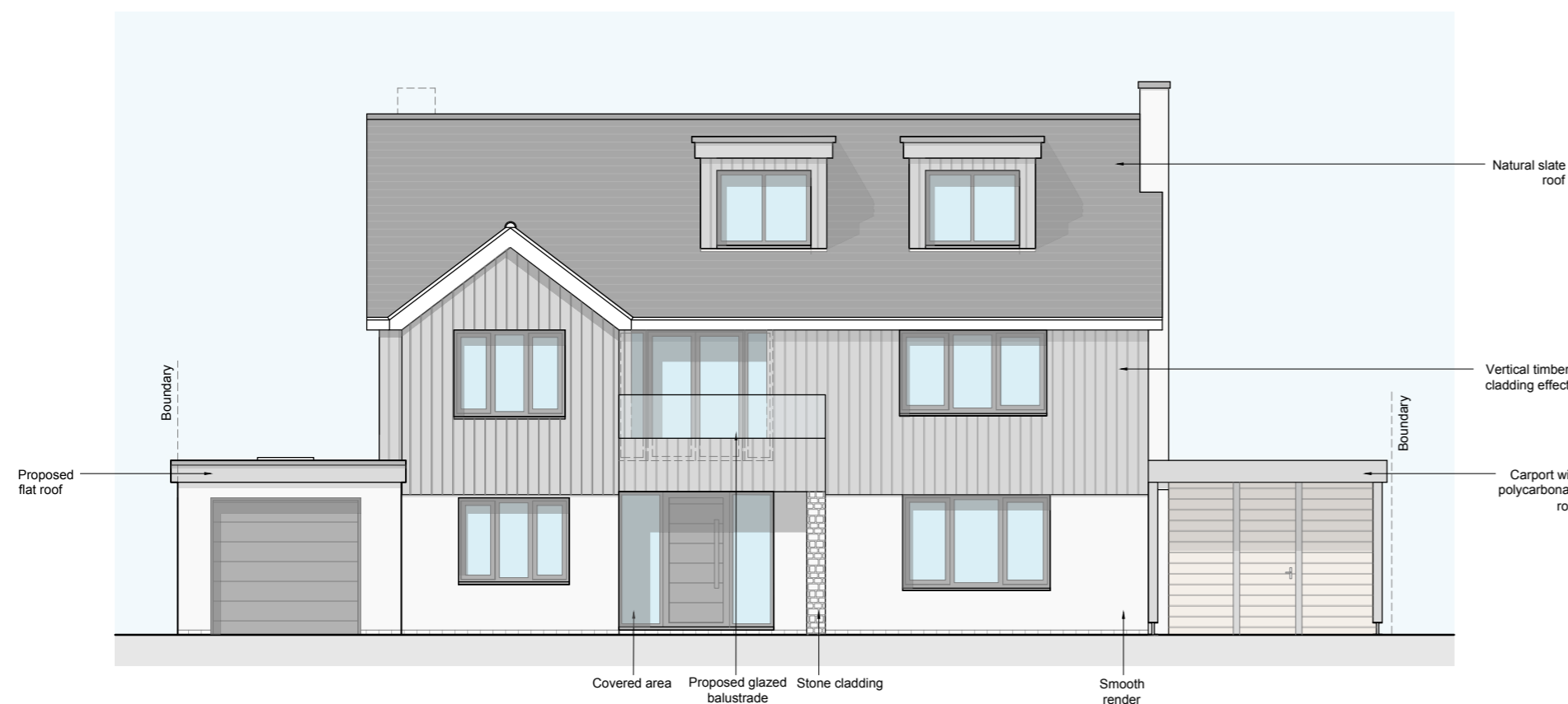
South Elevation (Front)