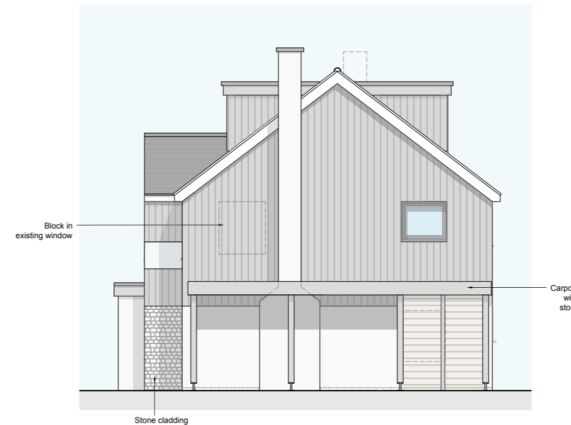
East Elevation (Side)