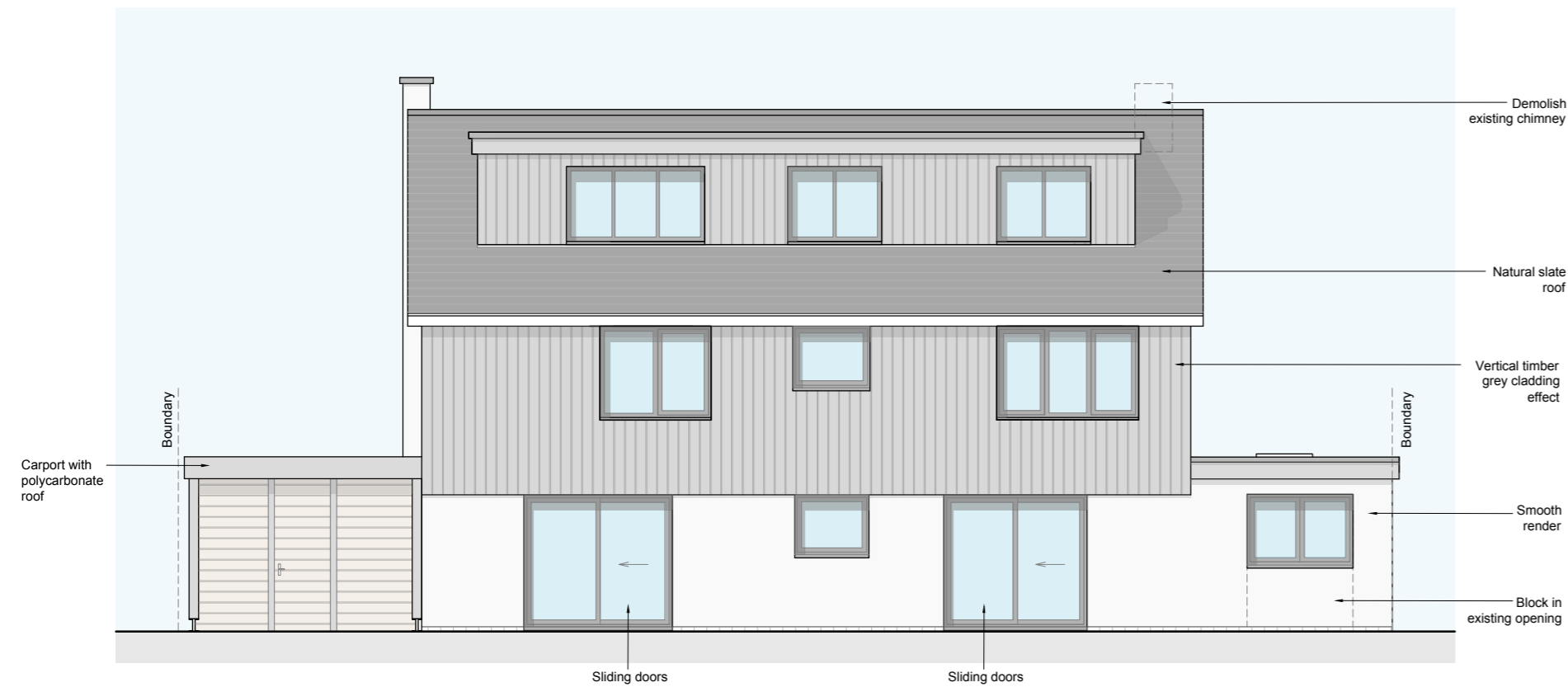
North Elevation (Rear)