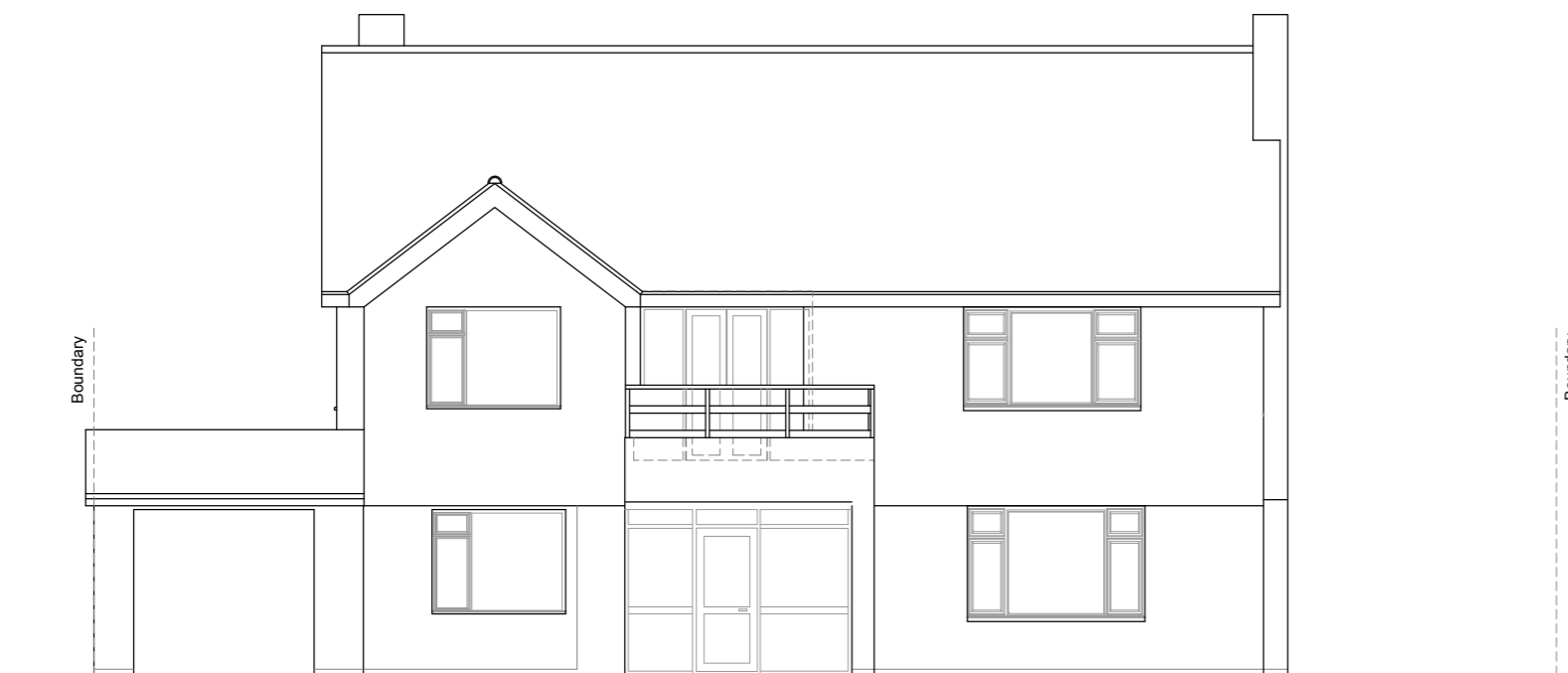
South Elevation (Front)