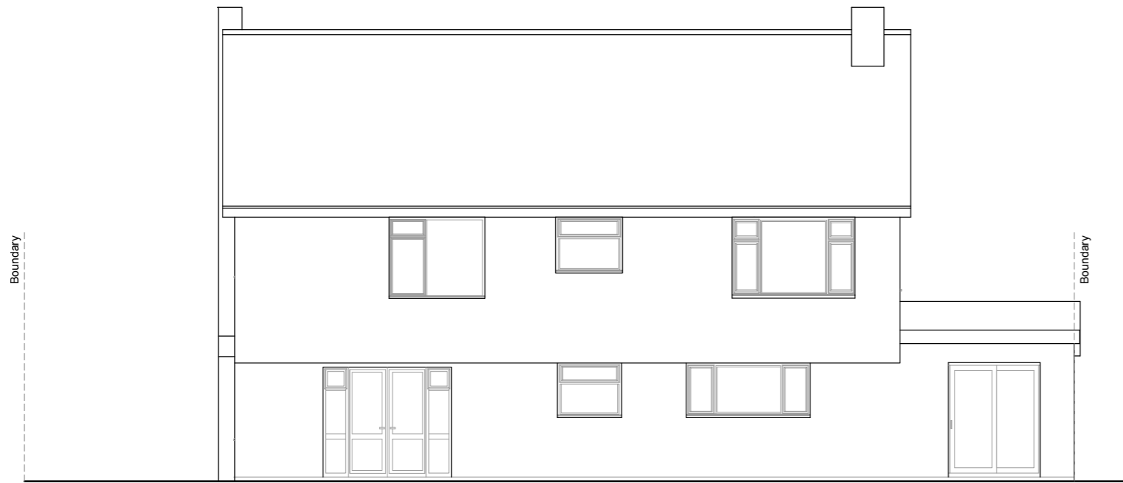
North Elevation (Rear)