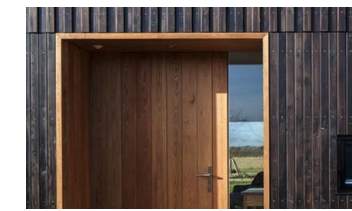
RECESSED ENTRANCE/WINDOW FRAMES