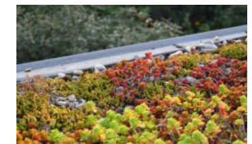
SEDUM GREEN ROOF