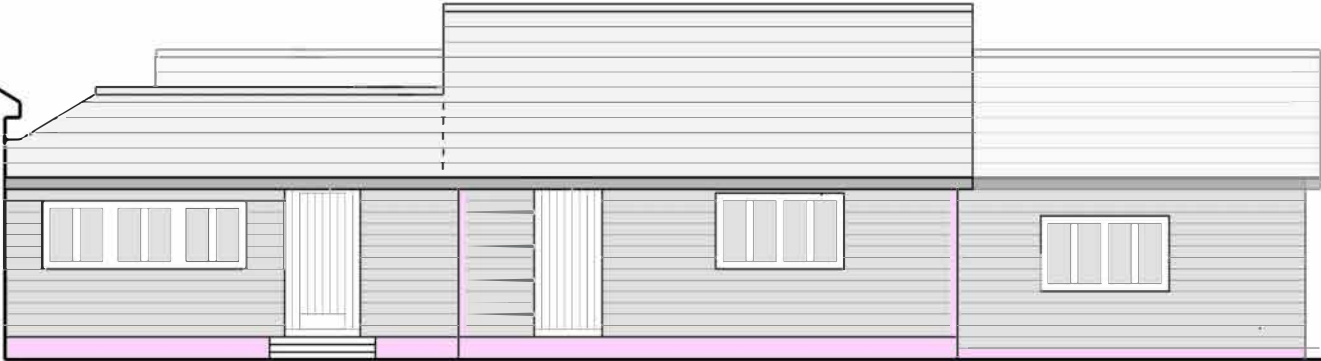
PROPOSED NEW PORCH/CORRIDOR ELEVATION @ 1:100 EXISTING RESIDENCE