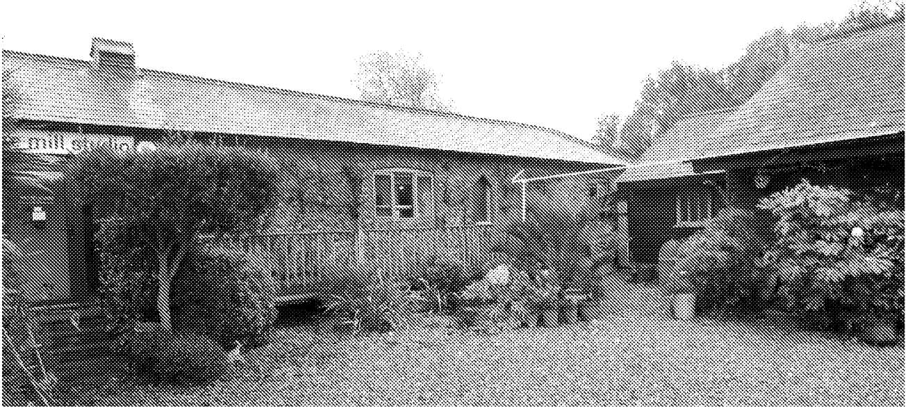
Junction between the Owners' Residence on the right and the end of the Studios 1 and 2 block on the left; the yellow lines indicate how it is proposed to extend the existing eaves/roof of the Owners' Residence to create a new porch/corridor to provide an enclosed link between the two buildings.