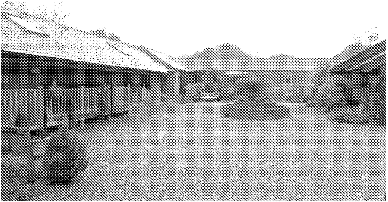
Looking north across the Courtyard to Studio 2; no changes to these elevations.