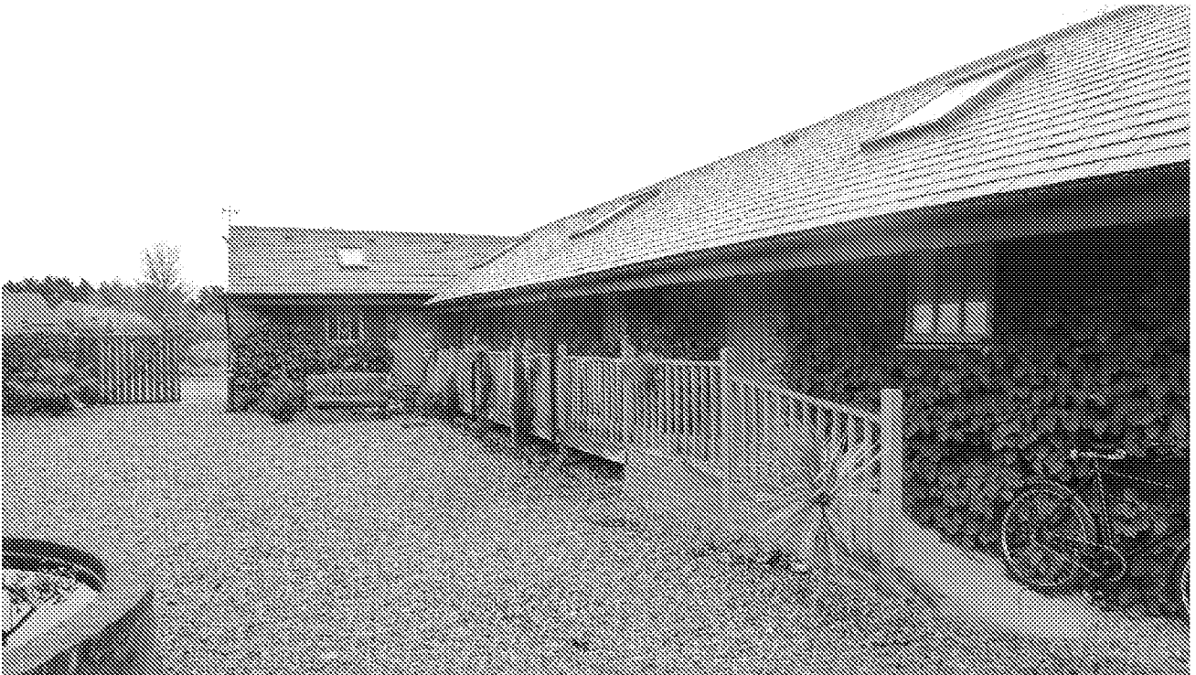
Studios 3 – 6, looking south; no changes to these elevations.

Consist of four individual tenanted artisan workshops, of recent modern construction. No changes to the accommodation or its present use are envisaged or planned.