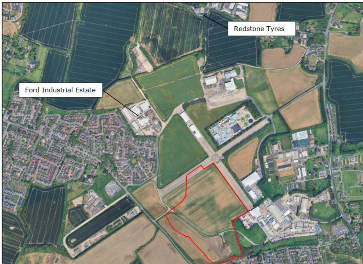
Figure 2: Location of Ford Industrial Estate and Redstone Tyres

The noise barriers which were proposed as part of the IRM planning application were designed to control noise from Ford Industrial Estate and Redstone Tyres. The location of these operations in relation to the RM4 (South) site boundary is shown in Figure 2.