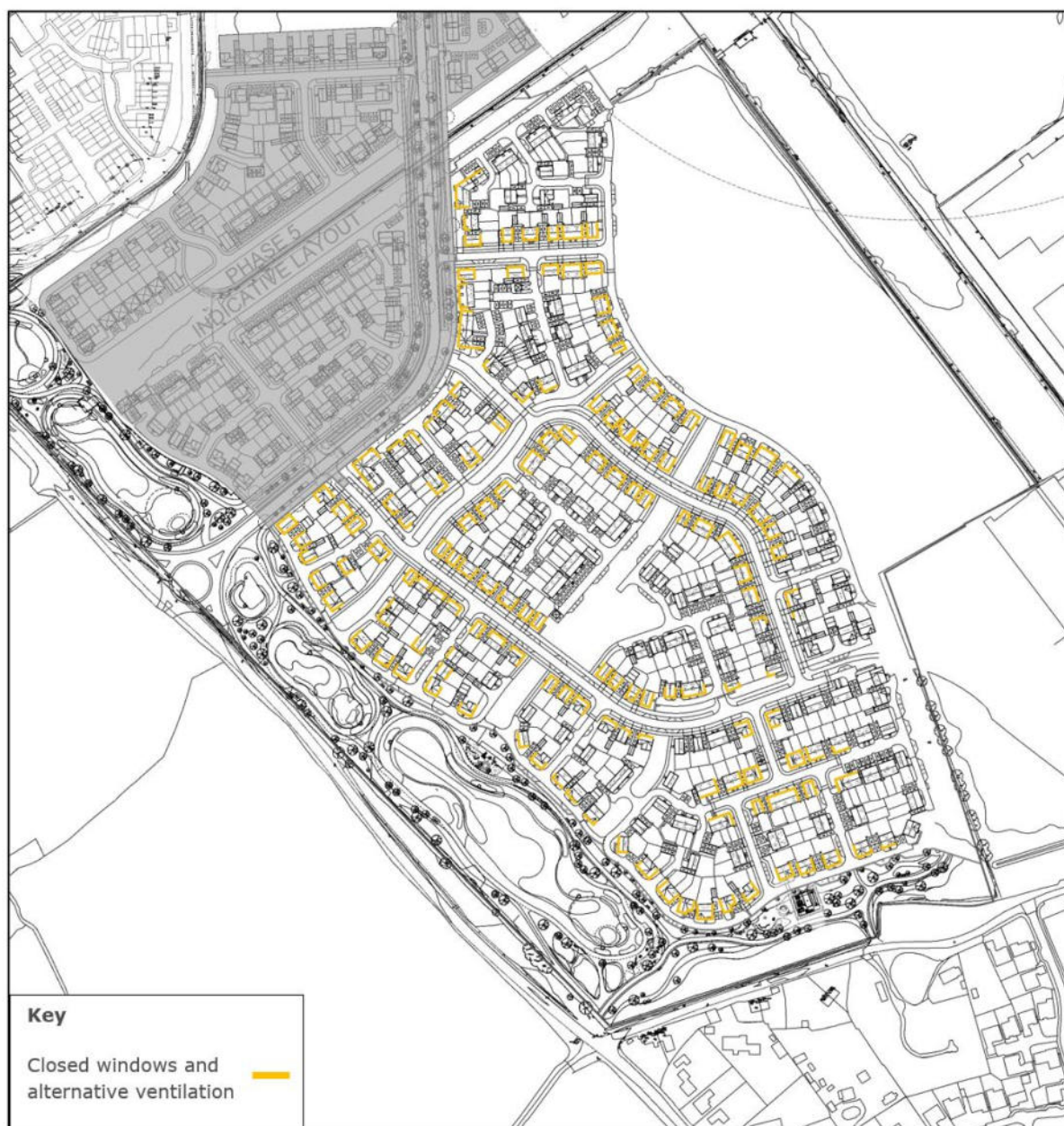
Figure 1: Closed Windows & Alternative Ventilation

An extract of the RM4 Noise Assessment presenting the markup of areas which require closed windows and alternative ventilation is presented in Figure 1.