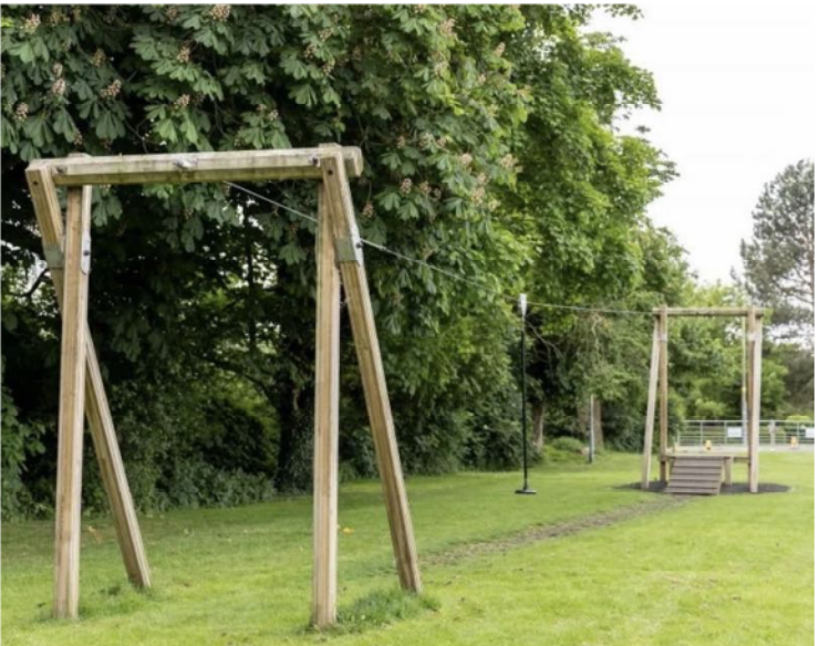
Typical aviation and movement themed play equipment to be included within the Runway Park LEAP (specification to be determined)