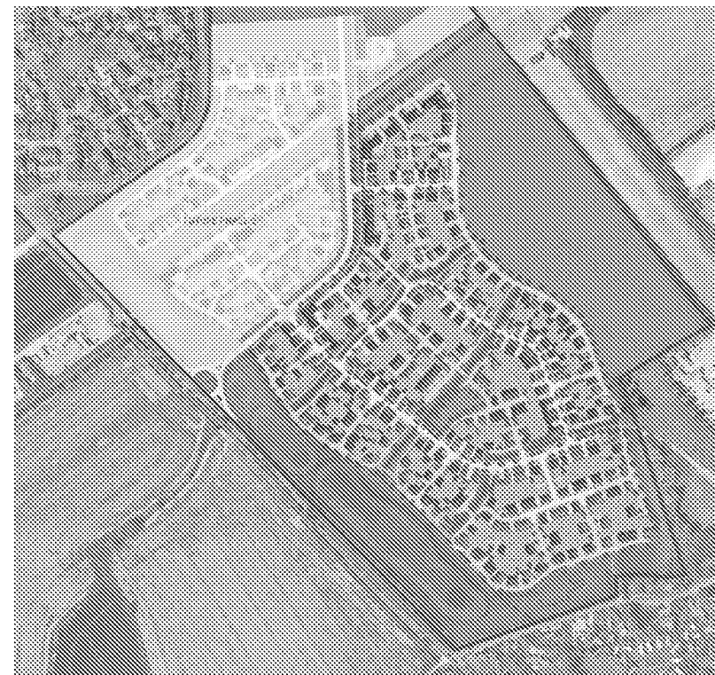
Figure 1. Proposed Site Layout – Ford Airfield, RM4.