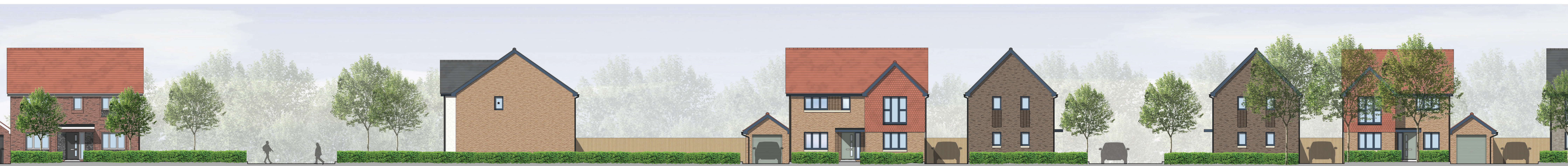
PROPOSED STREET SCENE (1 OF 6) @1:100

Plot No. 121 Plot No. 130 Plot No. 129 Plot No. 128 Plot No. 303 Plot No. 304 Plot No.