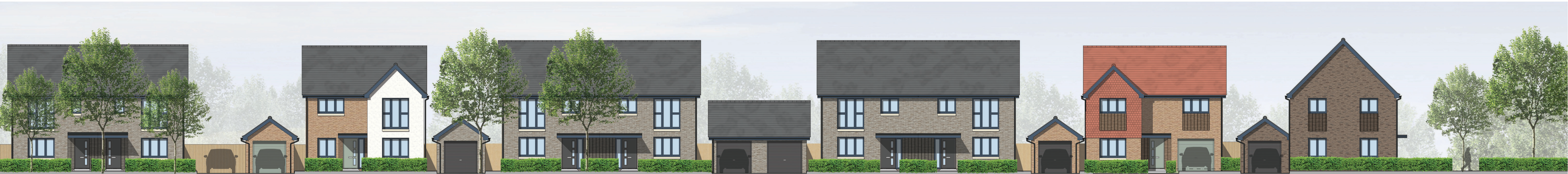
PROPOSED STREET SCENE (2 OF 6) @1:100

Plot No. 305 Plot No. 306 Plot No. 307 Plot No. 308 Plot No. 309 Plot No. 310 Plot No. 311 Plot No. 312 Plot No. 313