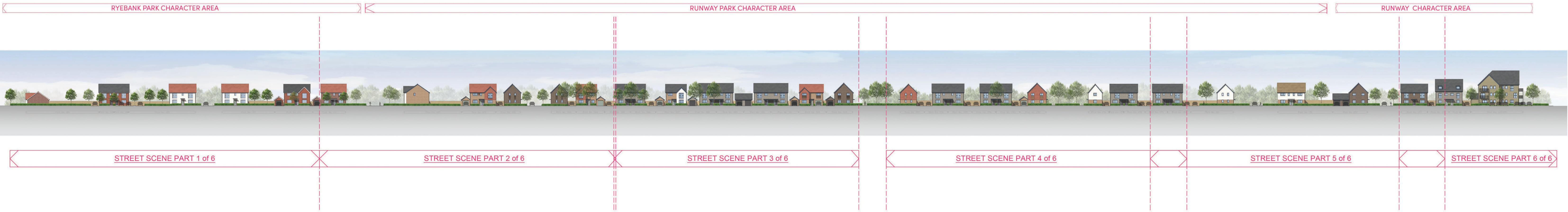
PROPOSED STREET KEY SCENE AA NOT TO SCALE