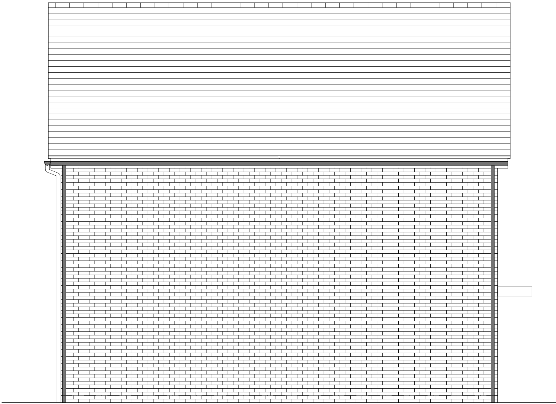
SIDE ELEVATION 1