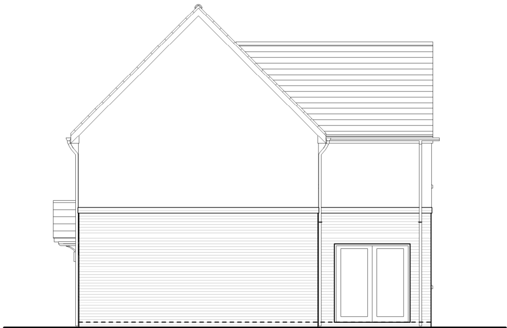
Right Side elevation