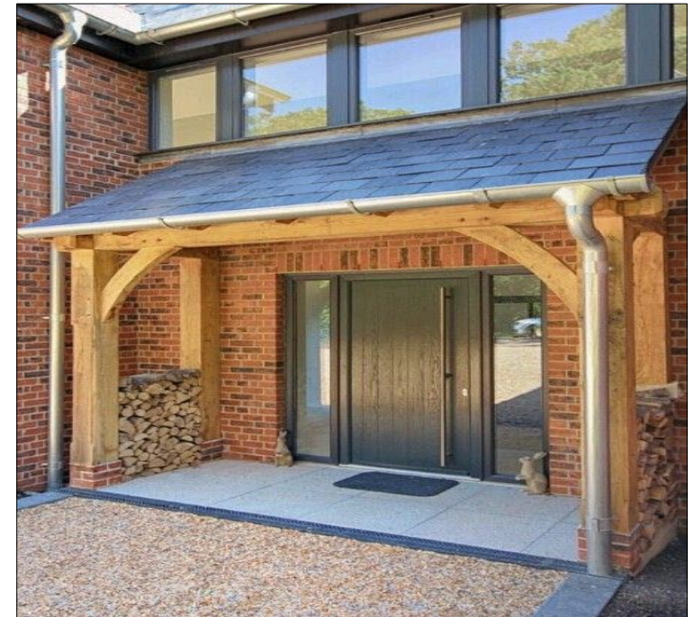
ENTRANCE CANOPY - Traditional oak - tiles to match existing house

Dwg. No. P-006 Title: Proposed Materials Address: 21 Goodwood Avenue, Felpham, PO22 8EH Client: Jonathan and Lauren Penn Scale: 1:100@A3 Stage: PLANNING Drawn: PS Date: February 2025