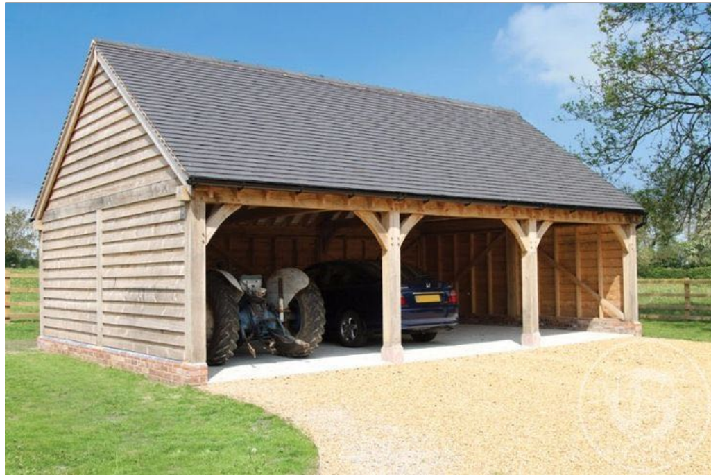
GARAGE - Triple timber - With doors