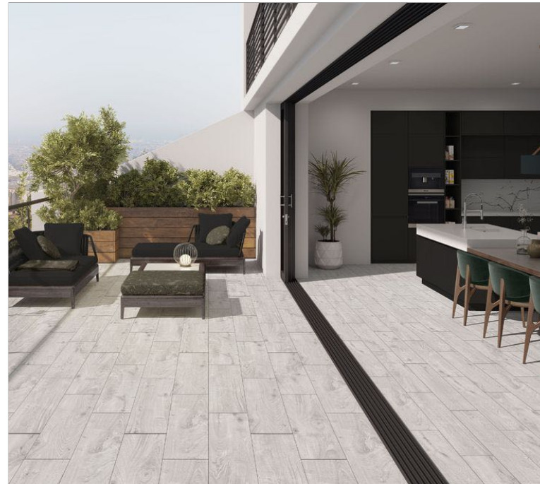
GARDEN TERRACE - Stone and level threshold