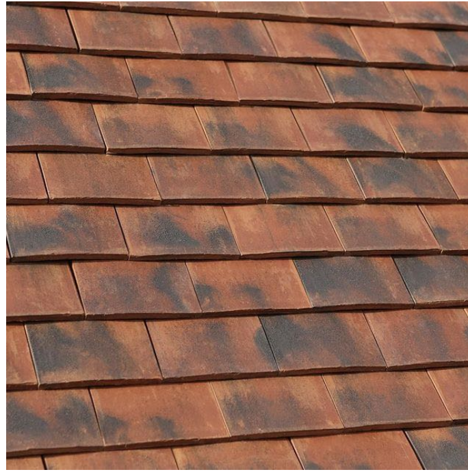
ROOF - Plain Clay Tile to match existing