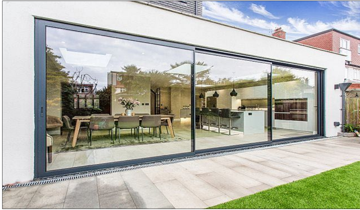
EXTENSION WALLS - Sliding doors and white render