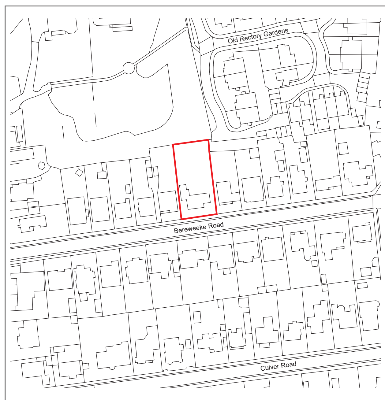
Existing Location Plan (1:1250)