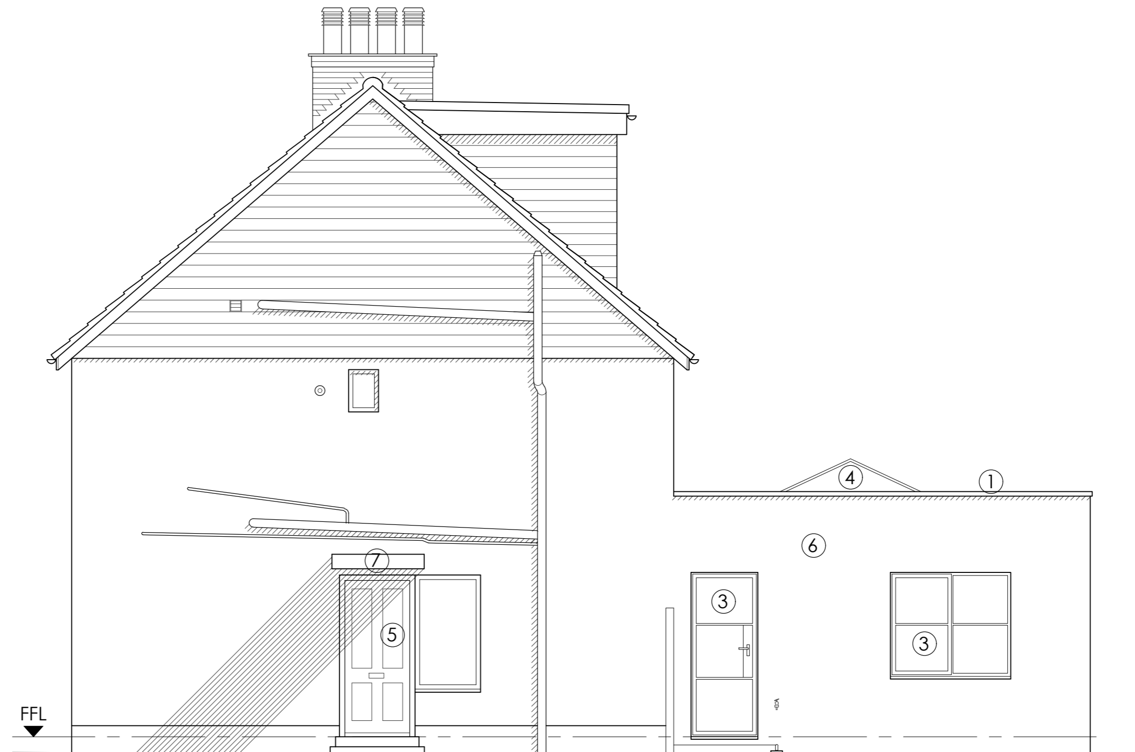
Proposed West Elevation Scale 1:50