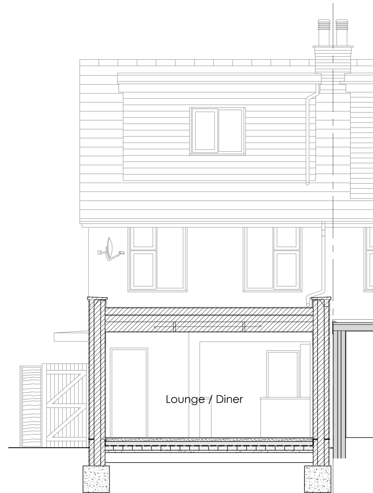
Proposed Section 2 Scale 1:50