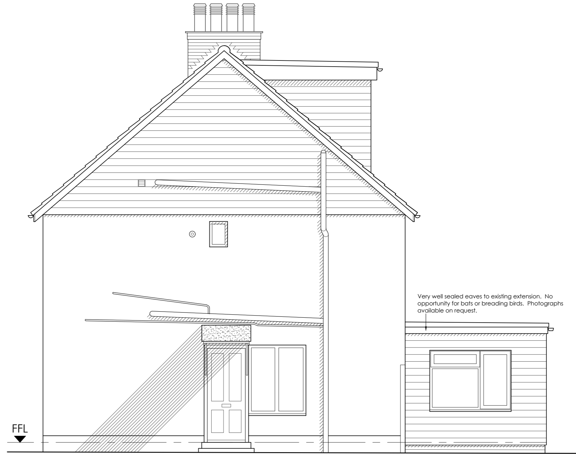
Existing West Elevation Scale 1:50