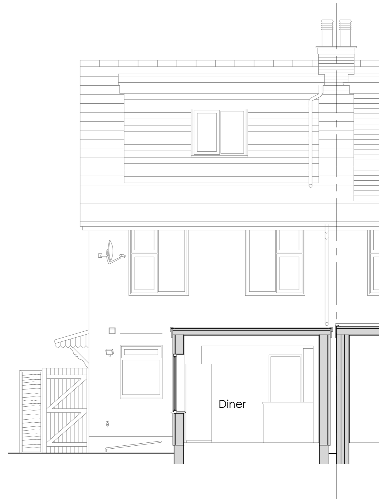
Existing Section 2 Scale 1:50