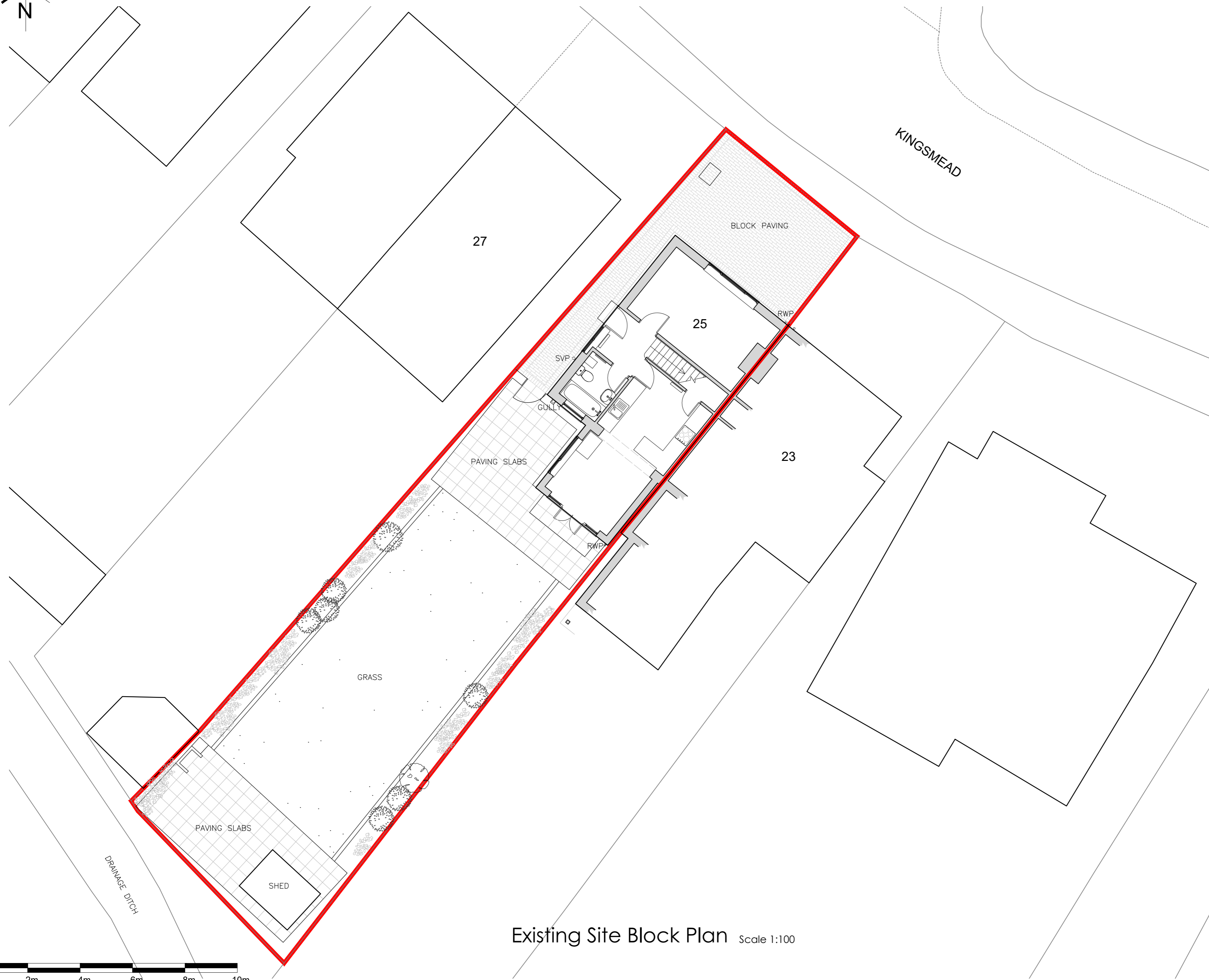
Existing Site Block Plan Scale 1:100