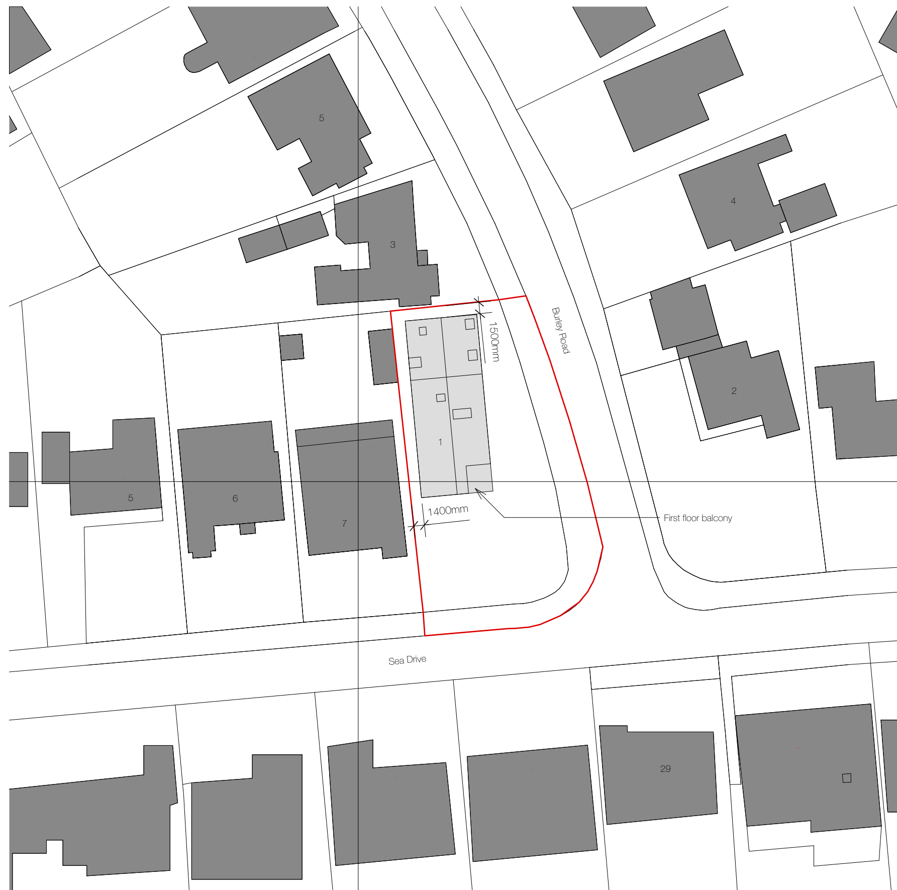
Block Plan 1:500 0m 5m 10m 15m 20m 25m 30m

Mapping contents © Crown copyright and database rights 2024 Ordnance Survey 100035207