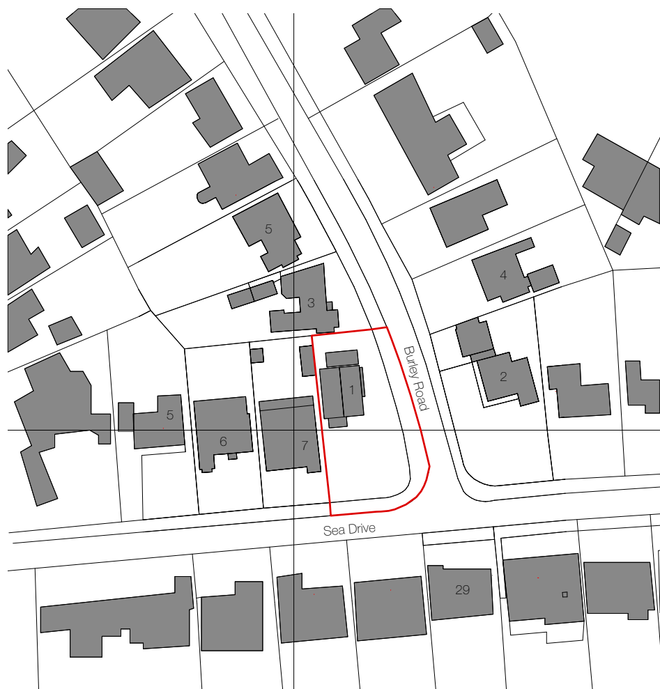
Location Plan 1:1250 0 10m 20m 30m 40m 50m 60m

Mapping contents © Crown copyright and database rights 2024 Ordnance Survey 100035207