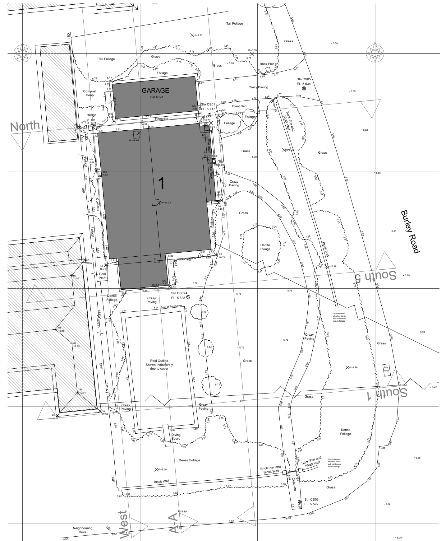
Existing Site Plan 1:200

Dwg. No. E-002 Title: Existing Site Plan Address: 1 Burley Road, Felpham, PO22 7NF Client: Mr and Mrs Packer Scale: Stated@A3 Stage: PLANNING Drawn: PS Date: November 2024