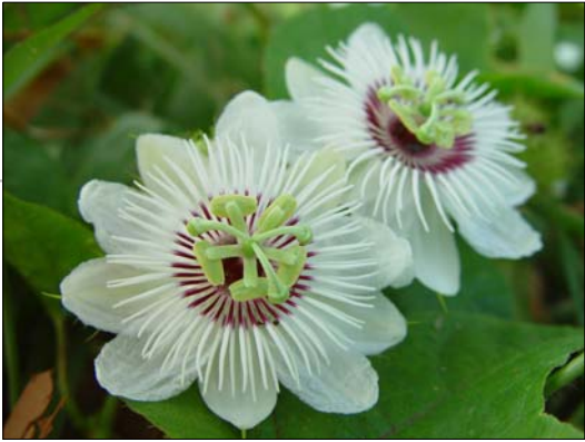
Passionfruit provide food for insects