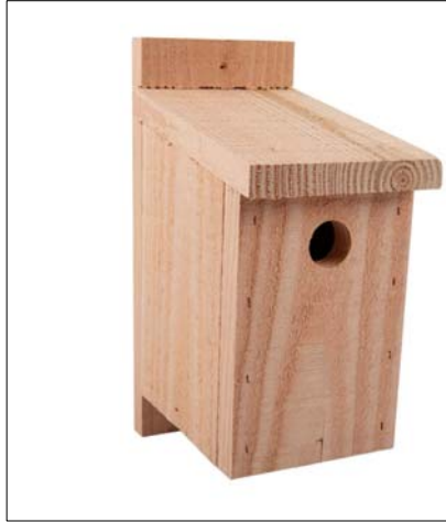
NHBS Wooden Bird Nest Box 32mm entrance hole Material: Wood Occupants: Great, Blue, Marsh ad Coal Tits, Redstarts, Nuthatches, Collard and Pied Flycatchers