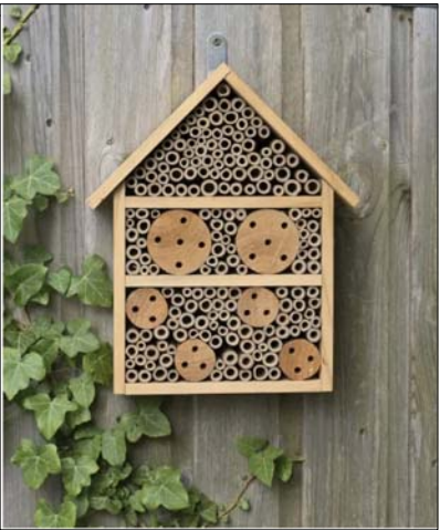
Large Insect House Material: Wood and bamboo tubes Occupants: Solitary bees, bees, insects