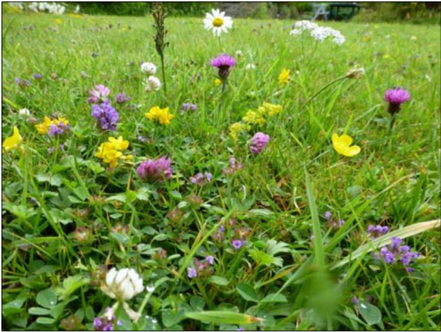
Low flowering lawn provides food and shelter for insects