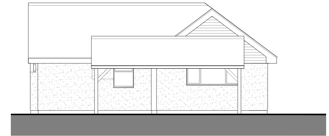
PROPOSED FRONT ELEVATION with car port