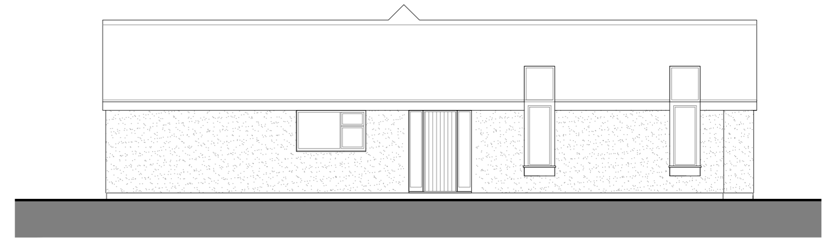
PROPOSED SIDE ELEVATION showing slot windows integrated with Velux