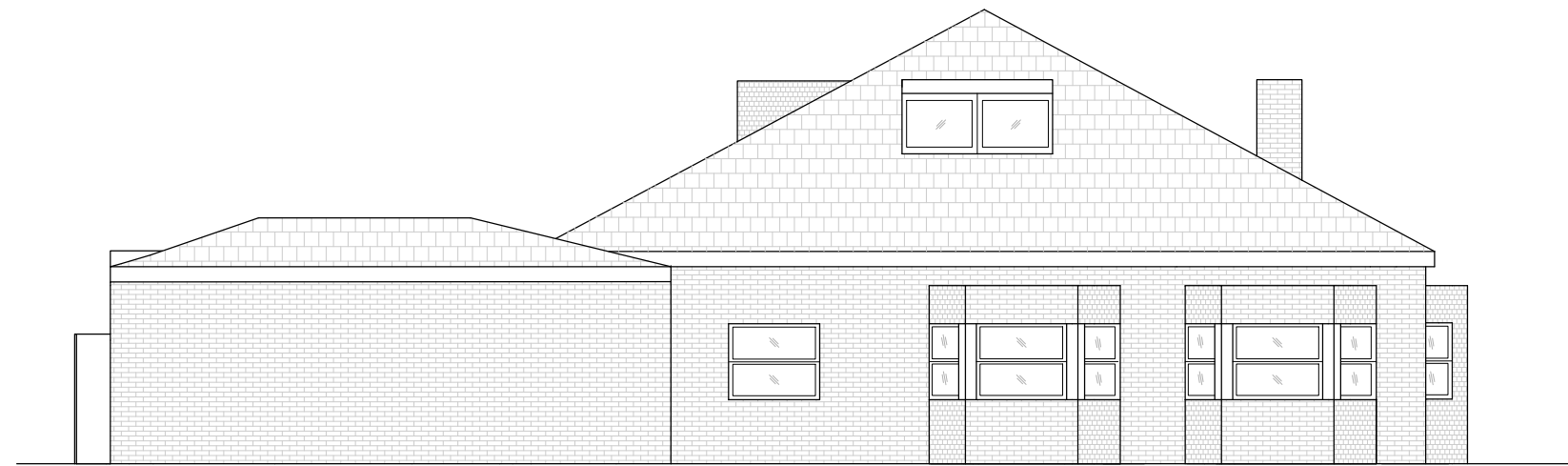
ELEVATION C-C (EAST) - PROPOSED (NO PROPOSED CHANGES)