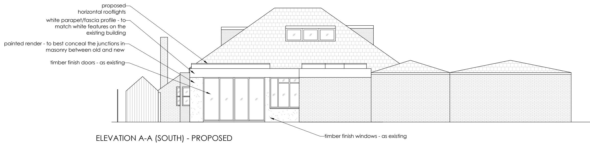
ELEVATION A-A (SOUTH) - PROPOSED