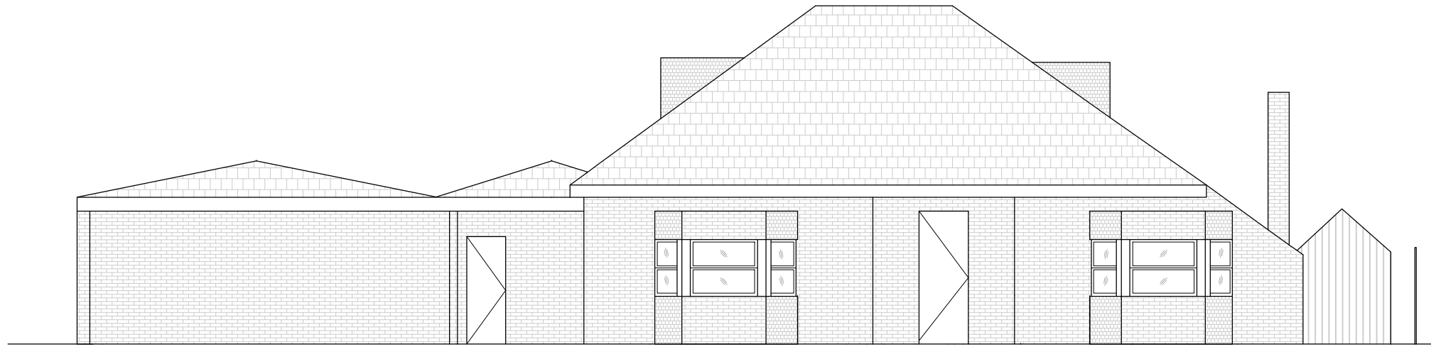
ELEVATION B-B (NORTH) FRONT - PROPOSED (NO PROPOSED CHANGES)